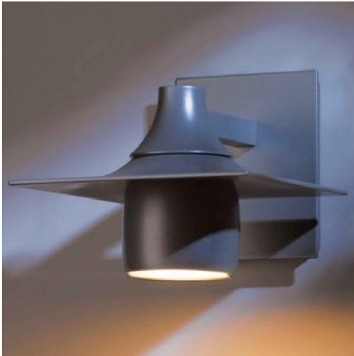
HUBBARDTON FORGE "HOOD" OUTDOOR DARK SKY COMPLIANT WALL SCONCE #306563. 15" HIGH X 6 1/2" WIDE. BURNISHED STEEL FINISH. 60 W INCANDESCENT LAMP

APPROVED BY RESOLUTION OF THE PLANNING BOARD OF THE CITY OF BEACON, NEW YORK, ON THE _____ DAY OF _____, 20____, SUBJECT TO ALL REQUIREMENTS AND CONDITIONS OF SAID RESOLUTION. ANY CHANGE, ERASURE, MODIFICATION OR REVISION OF THIS PLAT, AS APPROVED, SHALL VOID THIS APPROVAL. SIGNED THIS _____ DAY OF _____, 20____, BY _____ CHAIRMAN _____ SECRETARY IN ABSENCE OF THE CHAIRMAN OR SECRETARY, THE ACTING CHAIRMAN OR ACTING SECRETARY RESPECTIVELY MAY SIGN IN THIS PLACE.