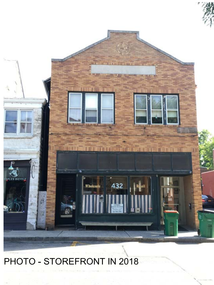
PHOTO - STOREFRONT IN 2018