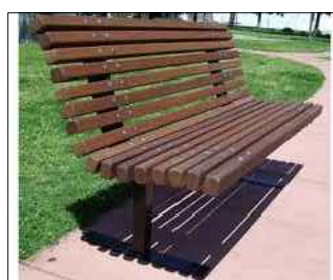
Bench Detail Scale: NTS