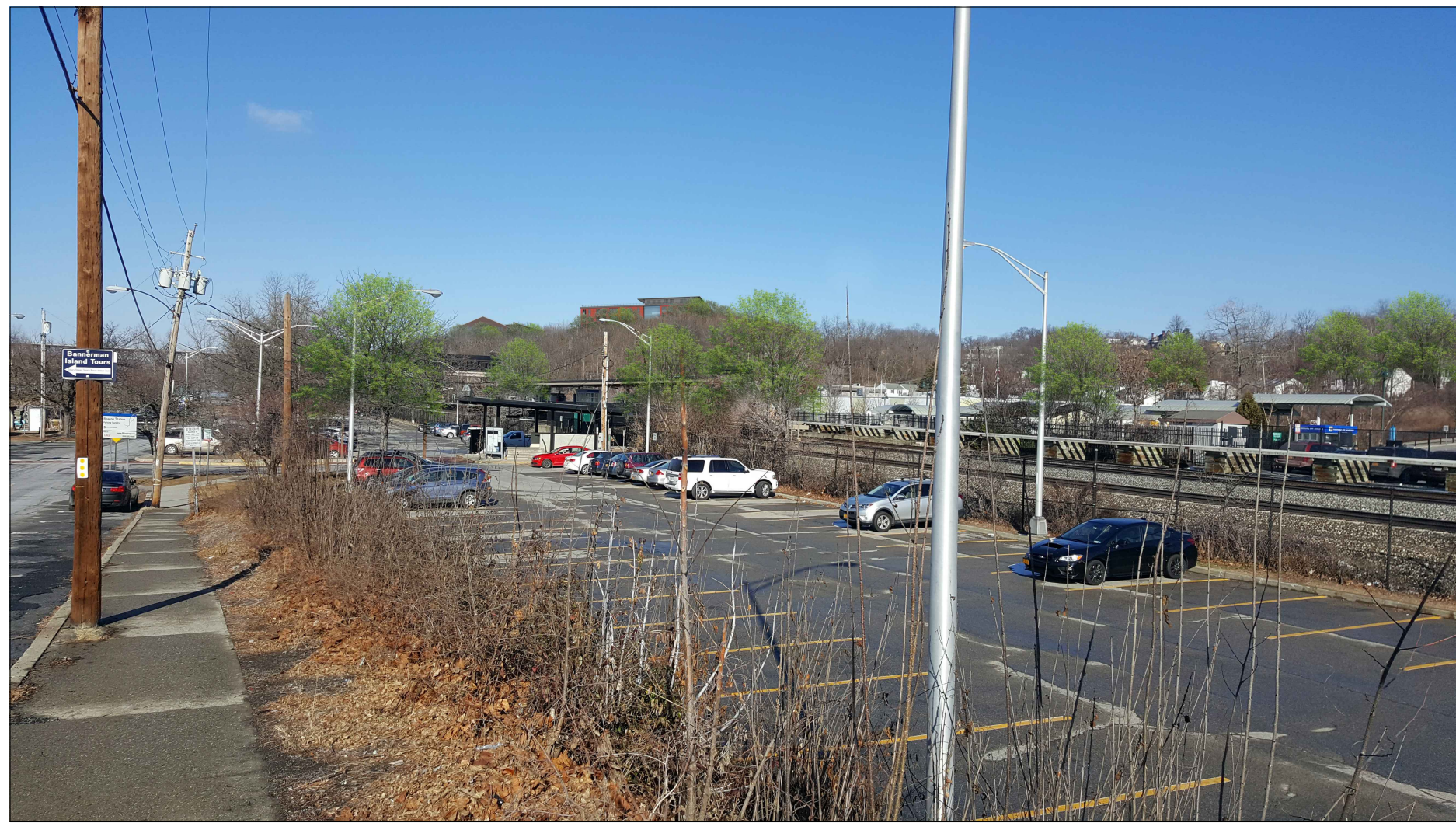
View From Train Station

APPROVED BY RESOLUTION OF THE PLANNING BOARD OF THE CITY OF BEACON, NEW YORK, ON THE _____ DAY OF _____, 20____, SUBJECT TO ALL REQUIREMENTS AND CONDITIONS OF SAID RESOLUTION, ANY CHANGE, ERASURE, MODIFICATION OR REVISION OF THIS PLAT, AS APPROVED, SHALL VOID THIS APPROVAL. SIGNED THIS _____ DAY OF _____, 20____, BY _____ CHAIRMAN SECRETARY IN ABSENCE OF THE CHAIRMAN OR SECRETARY, THE ACTING CHAIRMAN OR ACTING SECRETARY RESPECTIVELY MAY SIGN IN THIS PLACE.