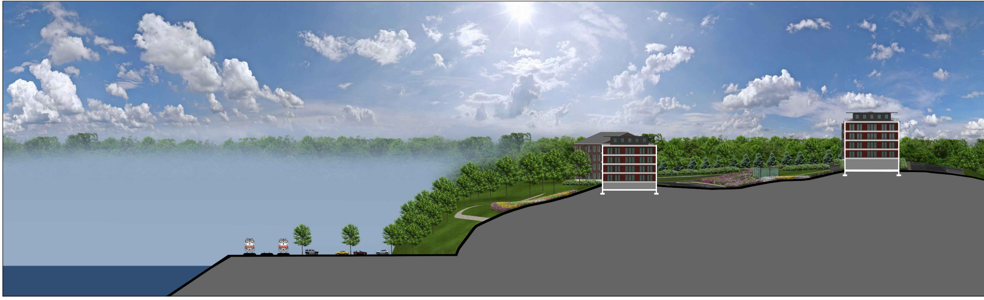
Site Section Renderings