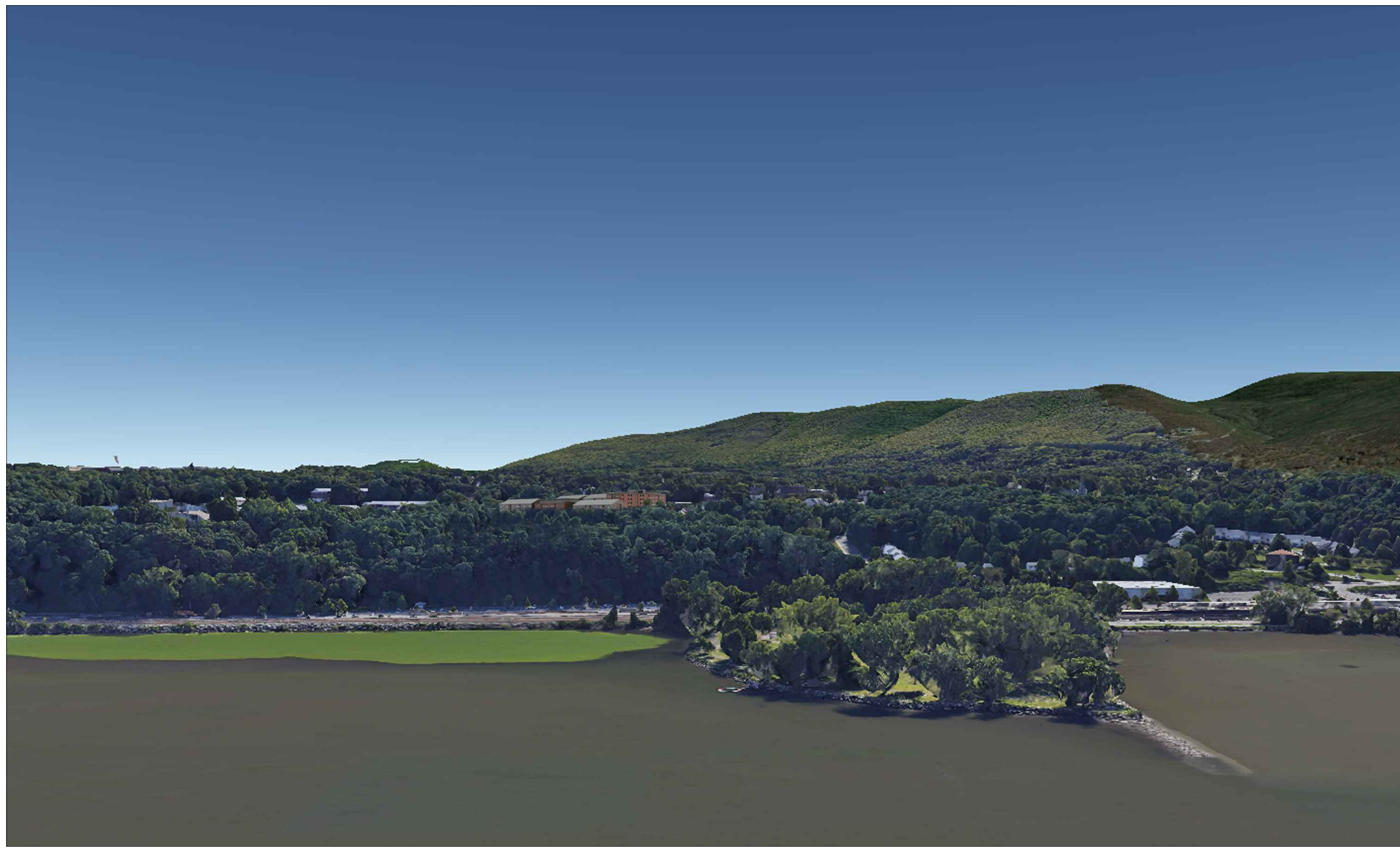
View From Hudson River