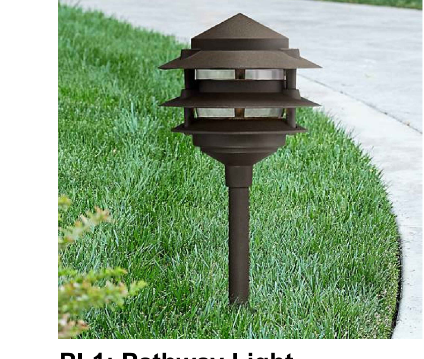
PL1: Pathway Light JOHN TIMBERLAND THREE-TIER PAGODA LOW VOLT BRONZE 4 WATT LED LANDSCAPE PATH LIGHT - STYLE # 2C488 (OR APPROVED EQUAL)

NOTE: THE MANUFACTURERS DO NOT PROVIDE PHOTOMETRIC INFORMATION FOR THESE FIXTURES. FIXTURES ARE SHIELDED TO AVOID LIGHT SPILLAGE ONTO ADJACENT PROPERTIES, AND TO SHIELD FROM LIGHT PROJECTING UPWARD TO THE SKY