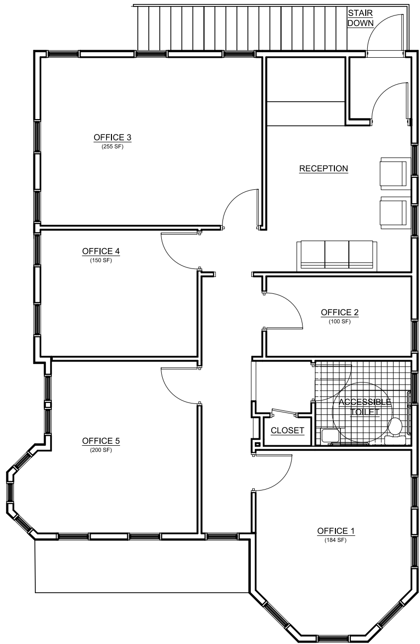
Proposed 2nd Floor Plan