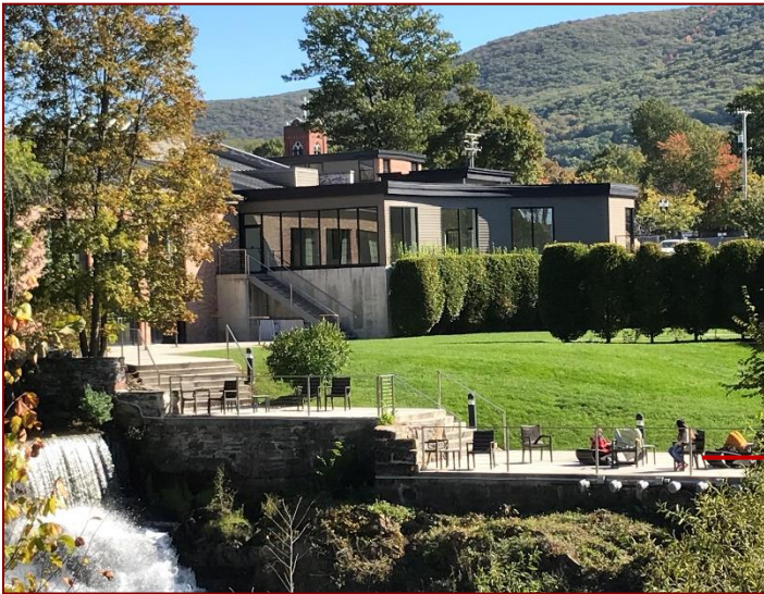
The Roundhouse at Beacon Falls

Every site should include at least one pedestrian-oriented gathering place, green, landscaped plaza, courtyard, terrace, or outdoor eating area, using the building forms to frame, overlook, or complement the space.