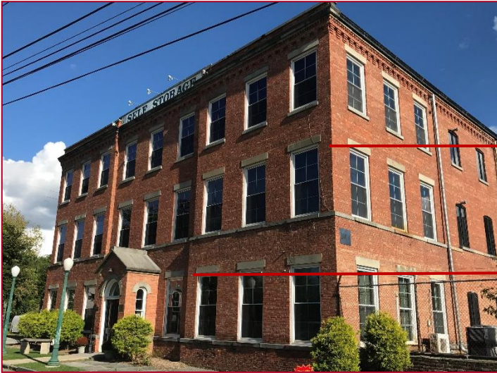
Front Street Building #4

Architectural features, materials, and windows shall be continued on all sides of the building, avoiding any blank walls.