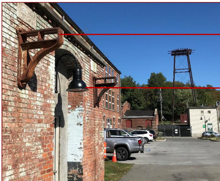
Beacon HIP Lofts, Mason Circle

Railings, balconies, entrance canopies, lighting fixtures, and other functional details should use industrial styles, metal materials, and darker colors.