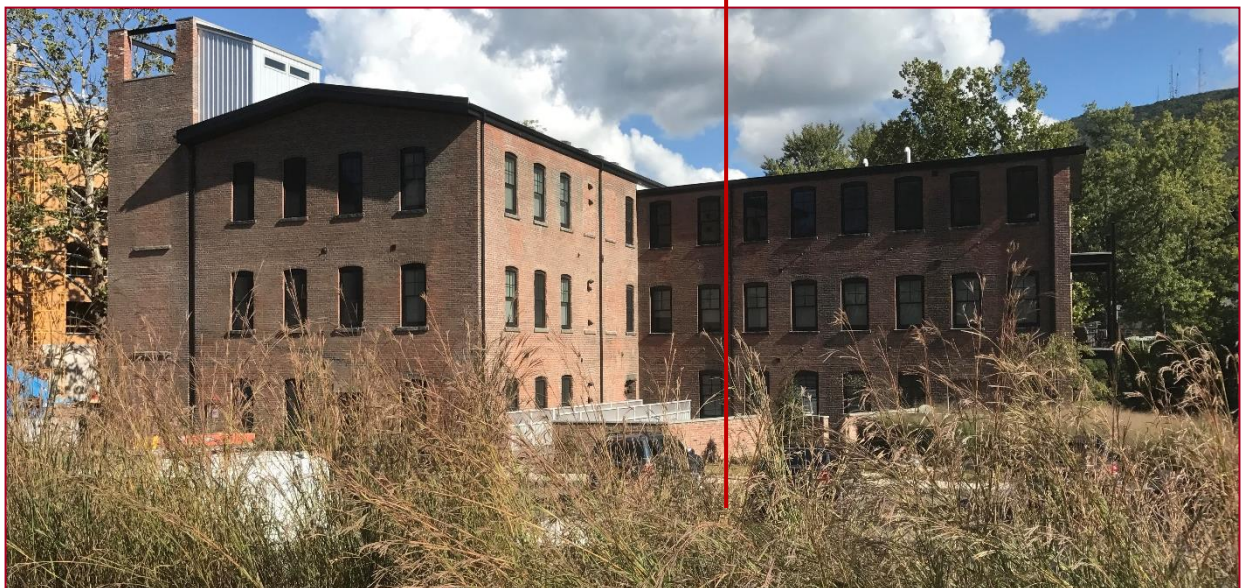
11 Creek Drive

Off-street parking, mechanical equipment, and refuse containers shall be located toward the rear or side of the site, under the ground floor of buildings, and/or screened from public views by approved landscaping or architectural elements.