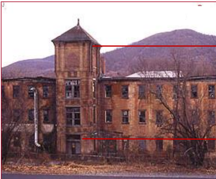
Former Factory Buildings at 248 Tioronda Avenue

Historic mill buildings in Beacon generally had simple forms and repetitive window openings with flat or low-pitched gable roofs.