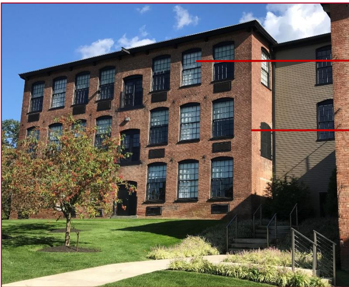
12 East Main Street

Larger buildings should incorporate subtle breaks in the façade and window surrounds with projecting sills, lintels, or crowns to add some depth and detail.