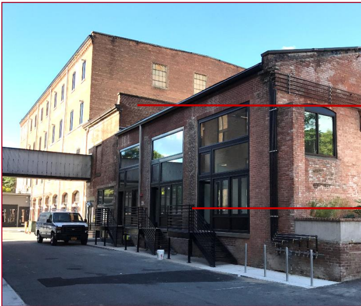
Beacon HIP Lofts, Mason Circle

Every site should include at least one pedestrian-oriented gathering place, green, landscaped plaza, courtyard, terrace, or outdoor eating area, using the building forms to frame, overlook, or complement the space.