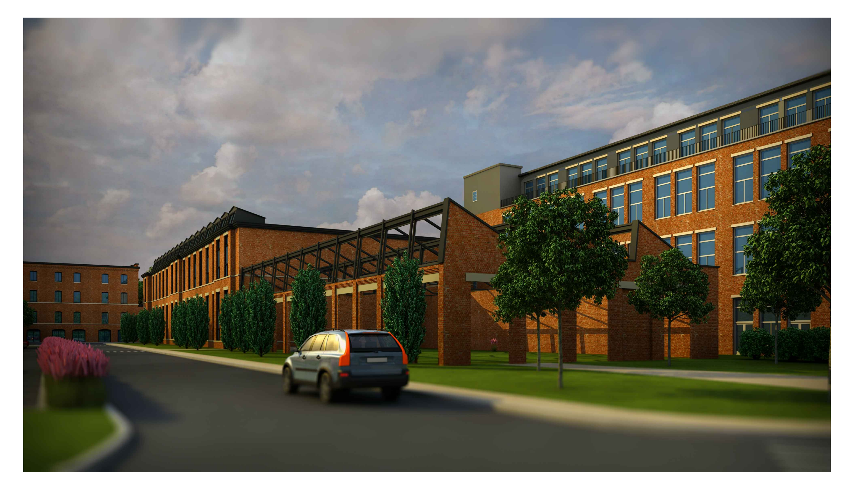
View to Northeast