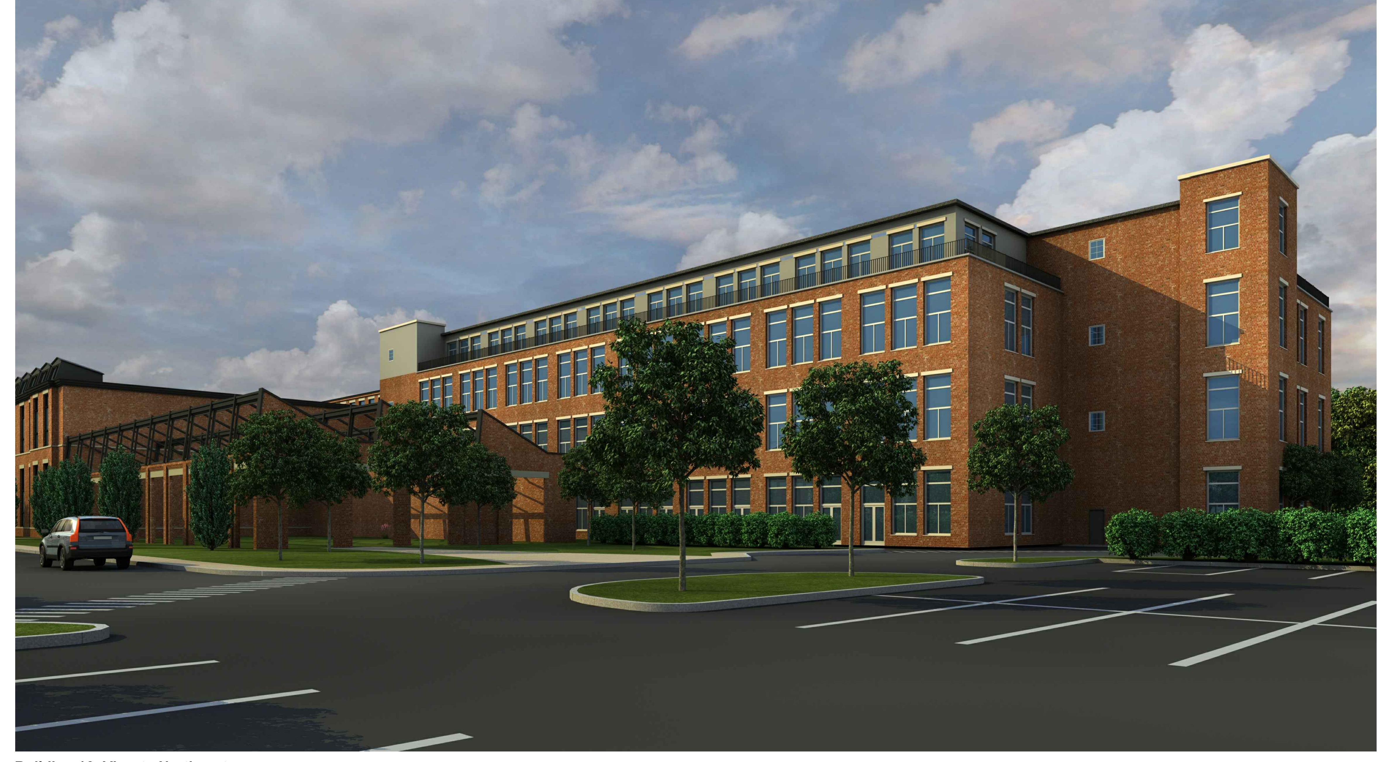
Building 16: View to Northeast Scale: NTS