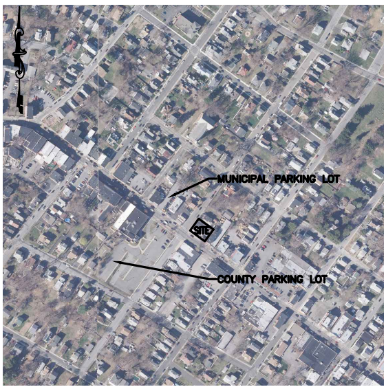
SITE LOCATION MAP SCALE: 1" = 300'