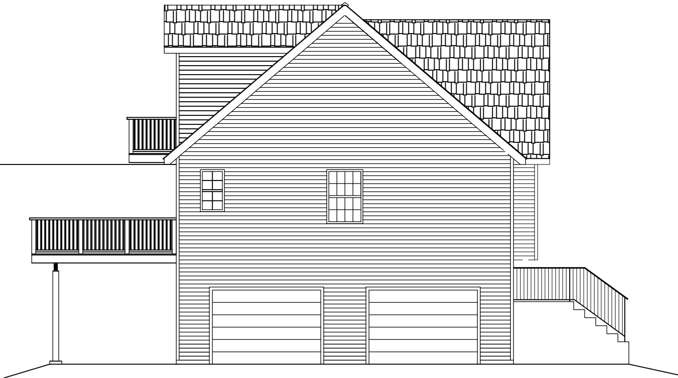
4 South Elevation SCALE 1/8" = 1'-0"