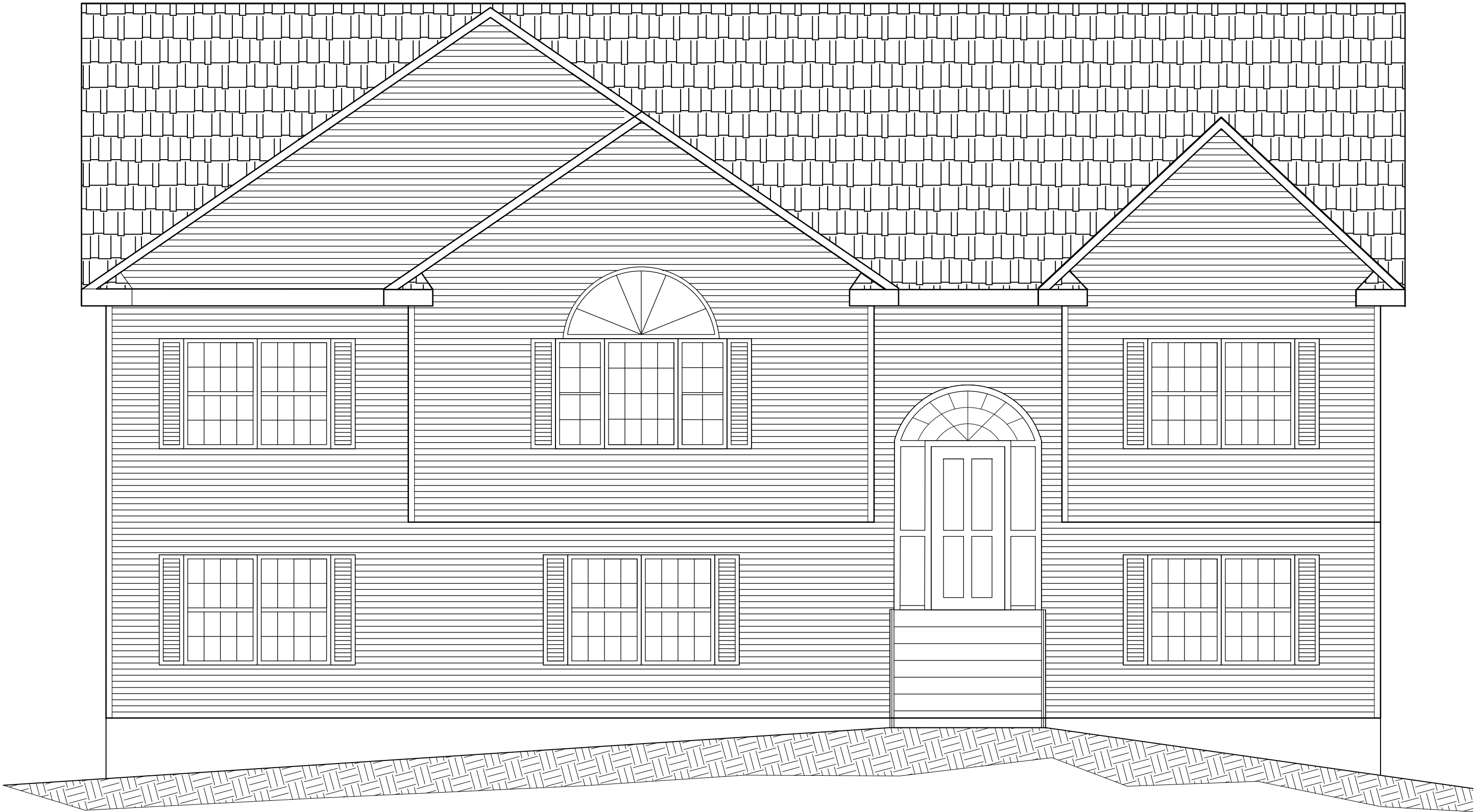
1 Front Elevation SCALE 1/8" = 1'-0"