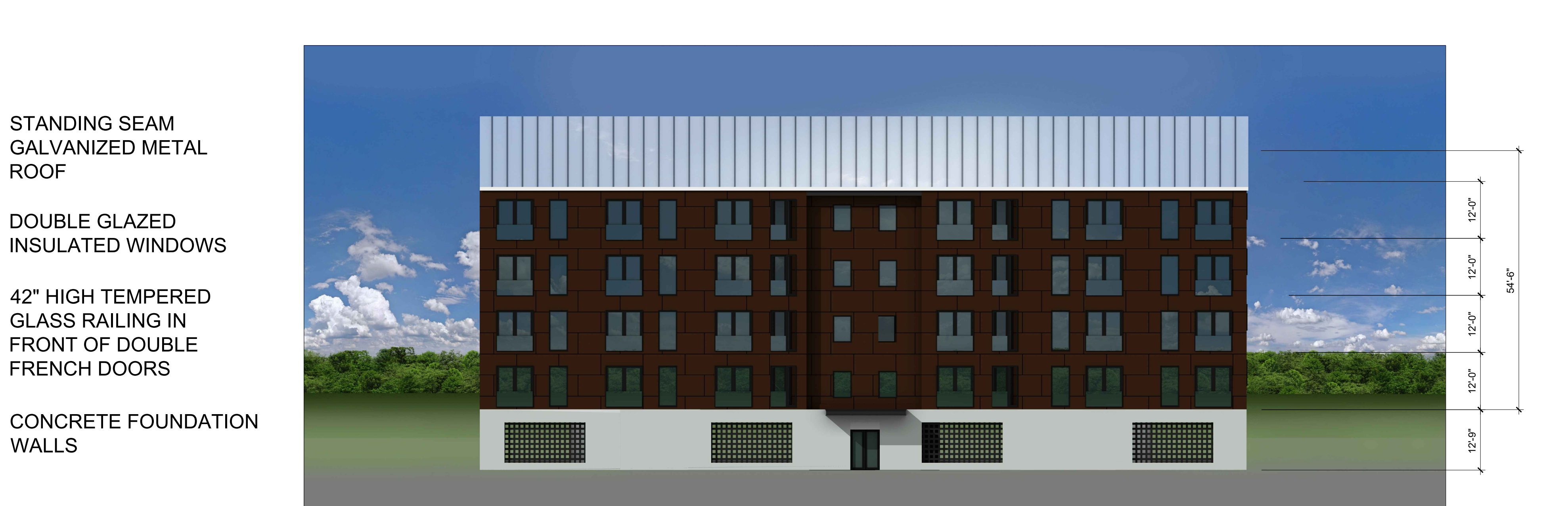
Building Elevation: Typical Gable Roof Building Over Podium