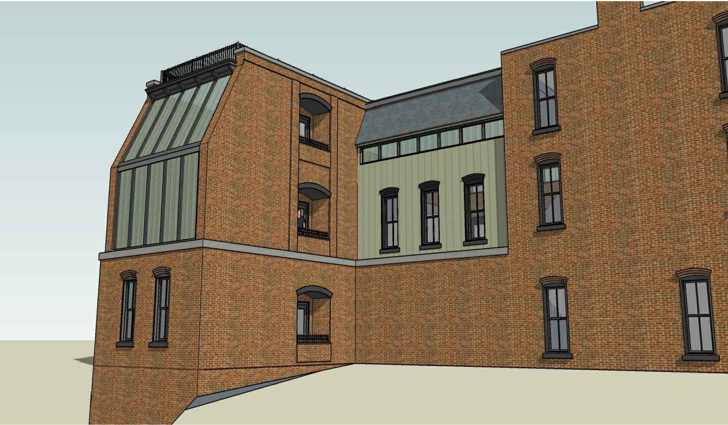
View: Tioronda Avenue