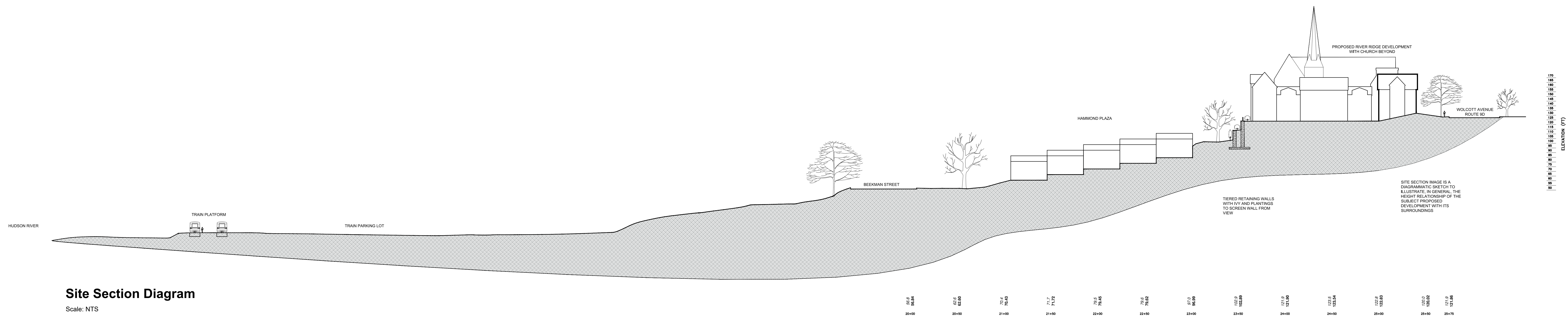
Site Section Diagram