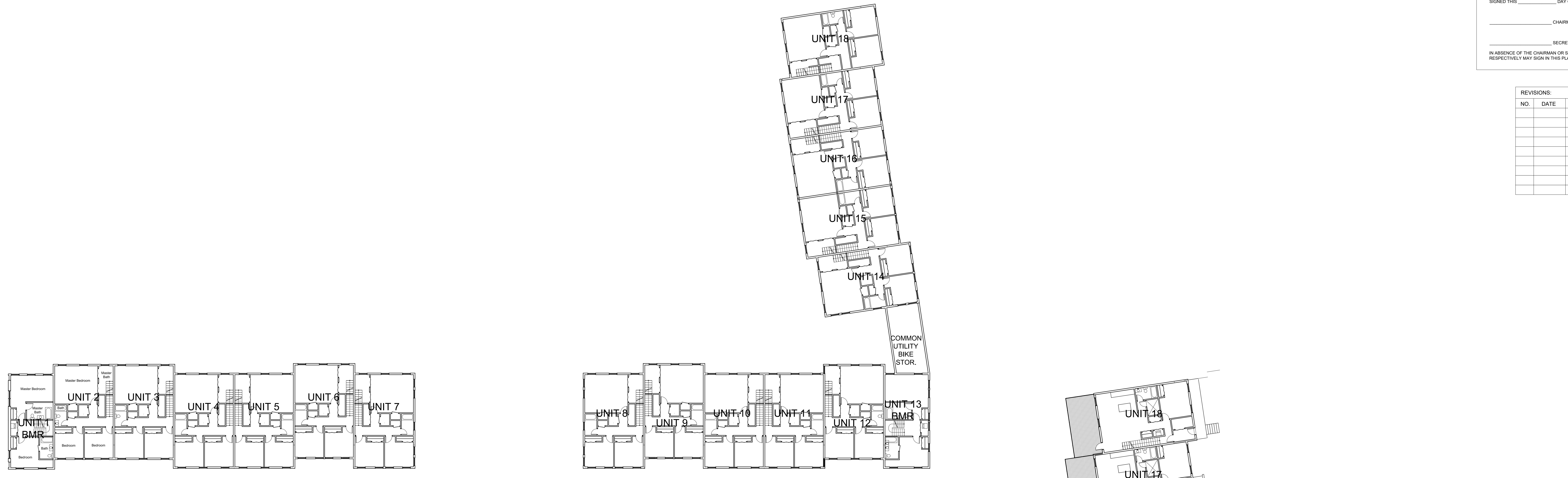
2nd Floor Plan Scale: 1/16" = 1'-0"