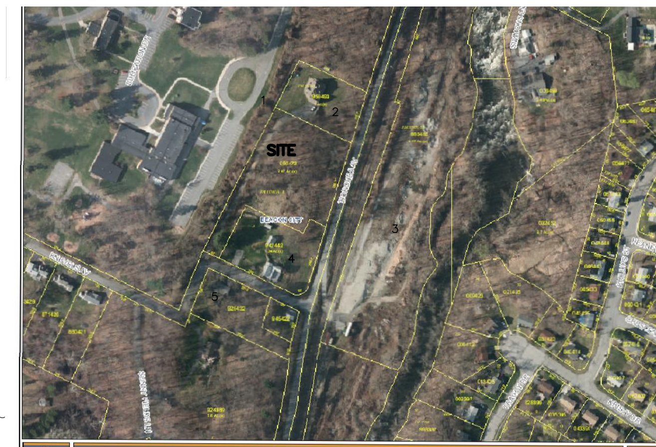
SITE LOCATION MAP SCALE: 1" = 400'