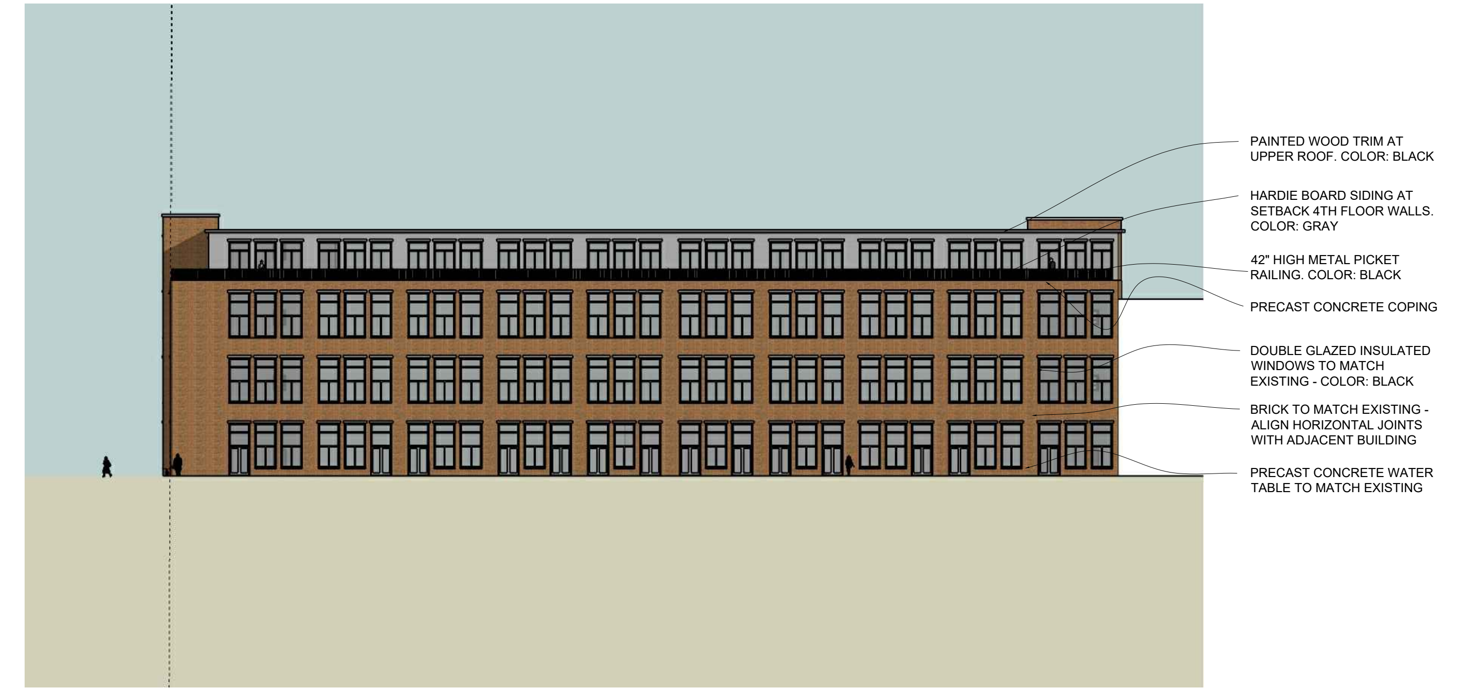
Elevation: Building 16: East Scale: 3/4" = 1'-0"