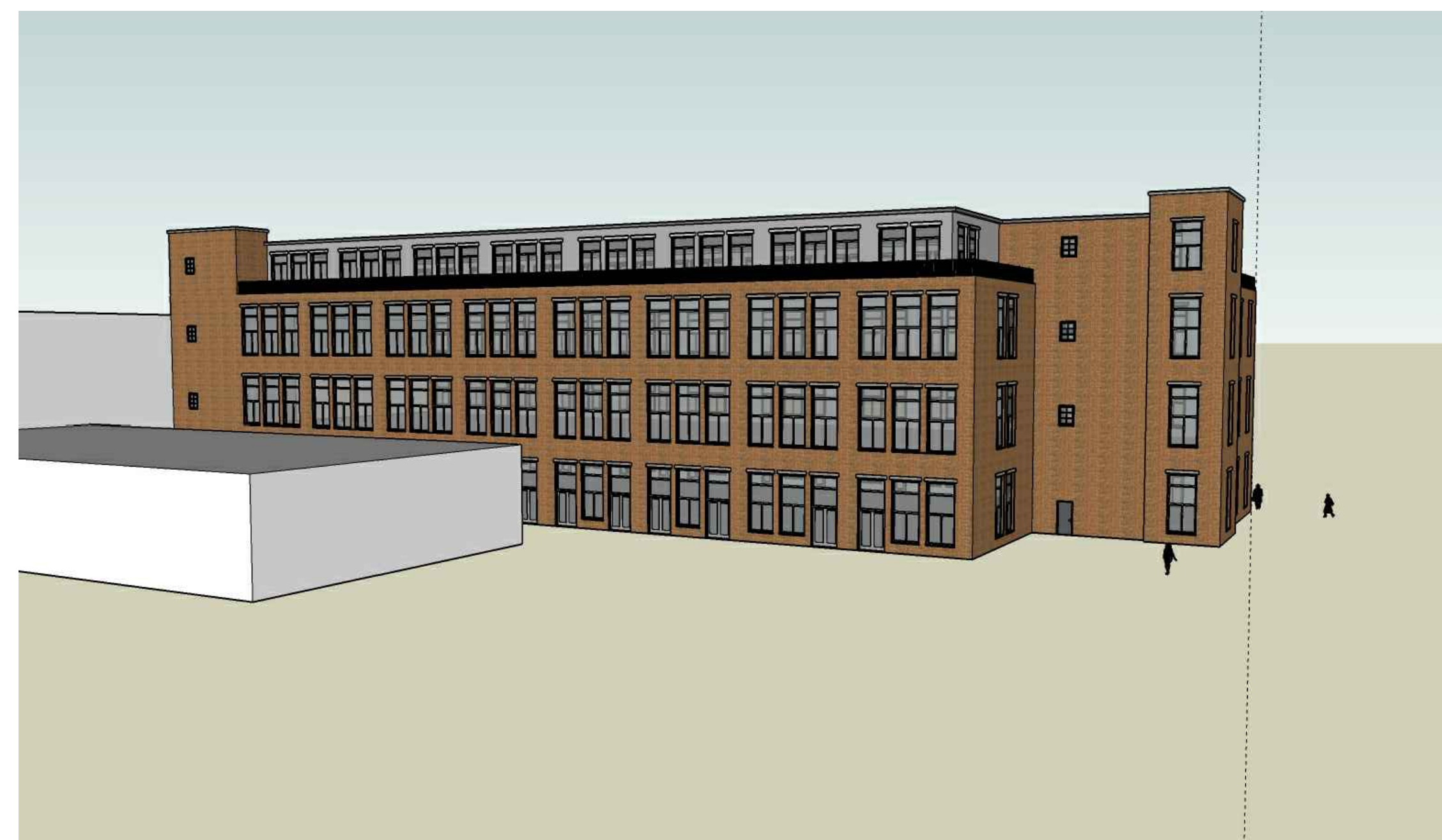
View to Northeast Scale: NTS