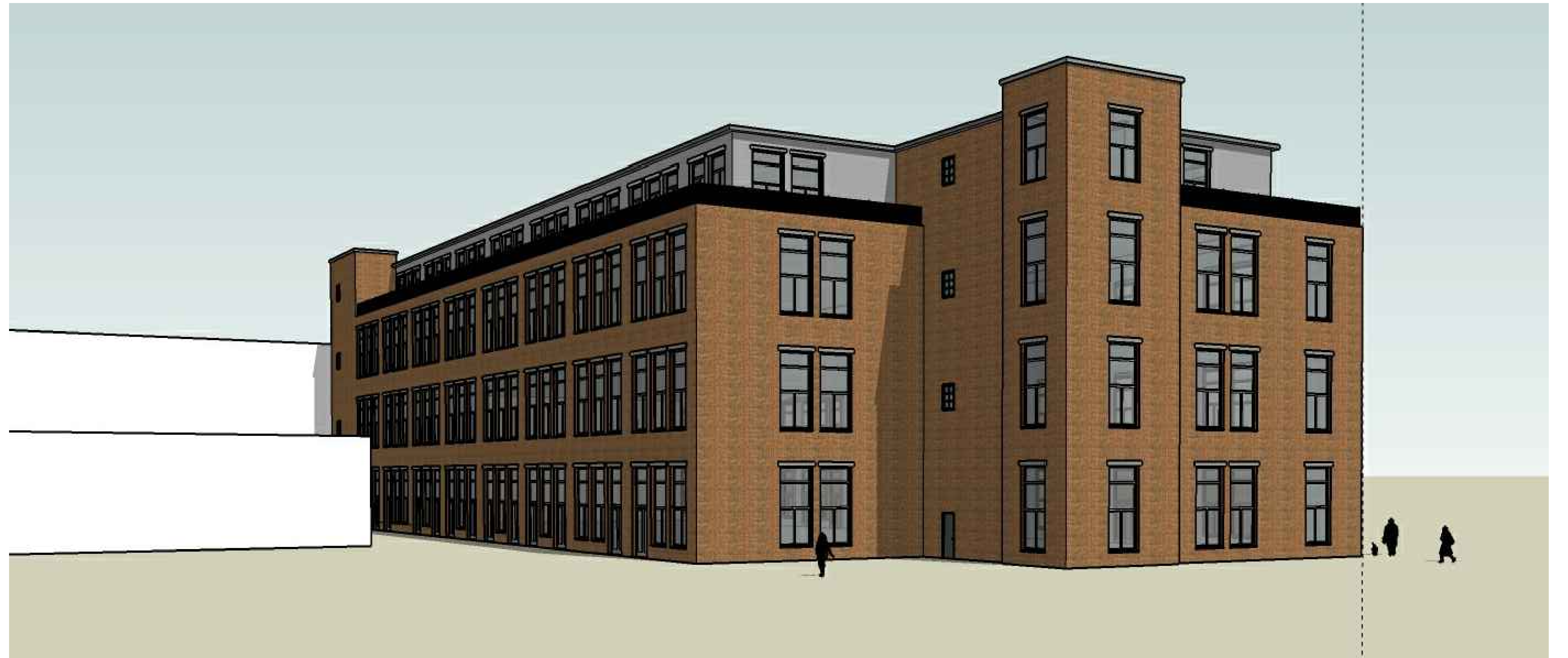
Building 16: View to Northeast Scale: NTS