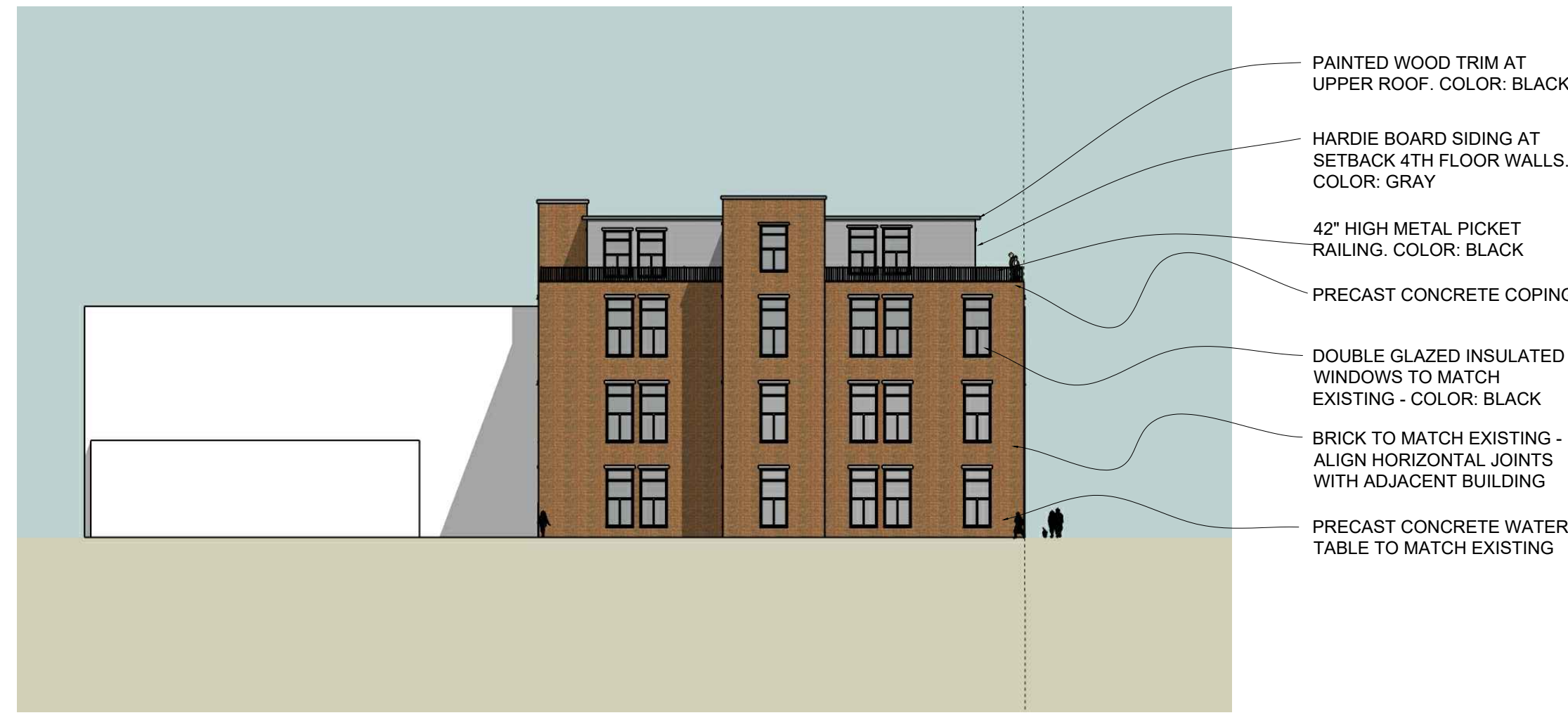
Elevation: Building 16: South Scale: 3/4" = 1'-0"