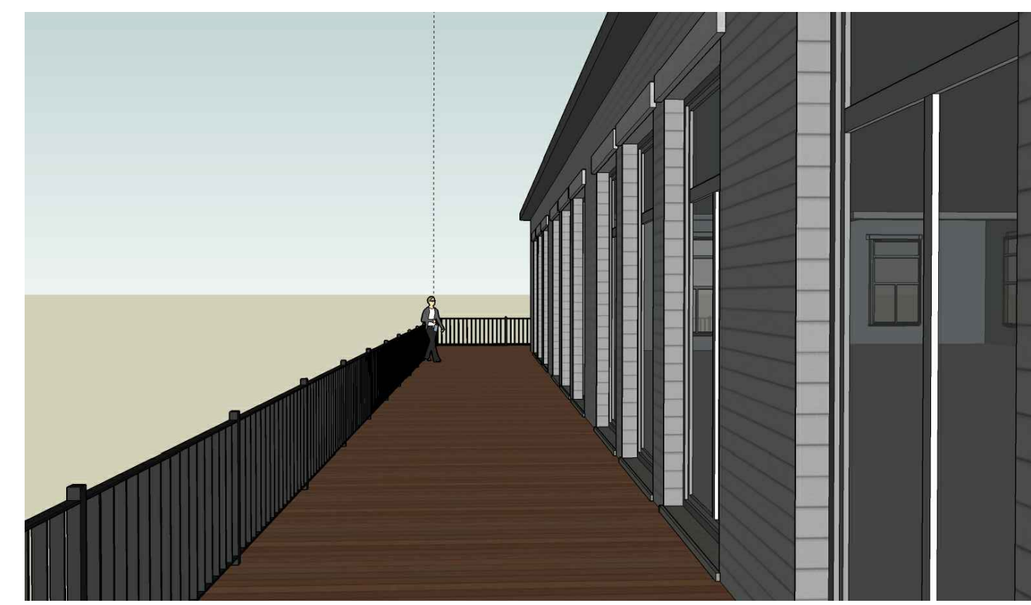
View from 4th Floor Deck Scale: NTS