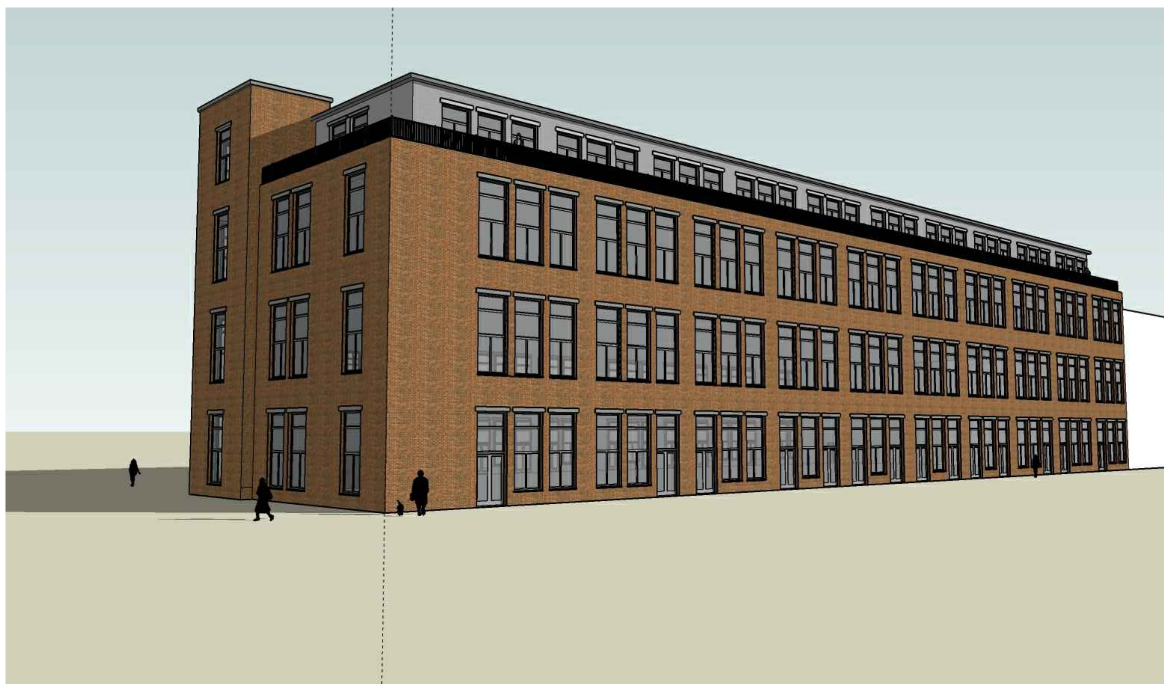
View to Northwest Scale: NTS