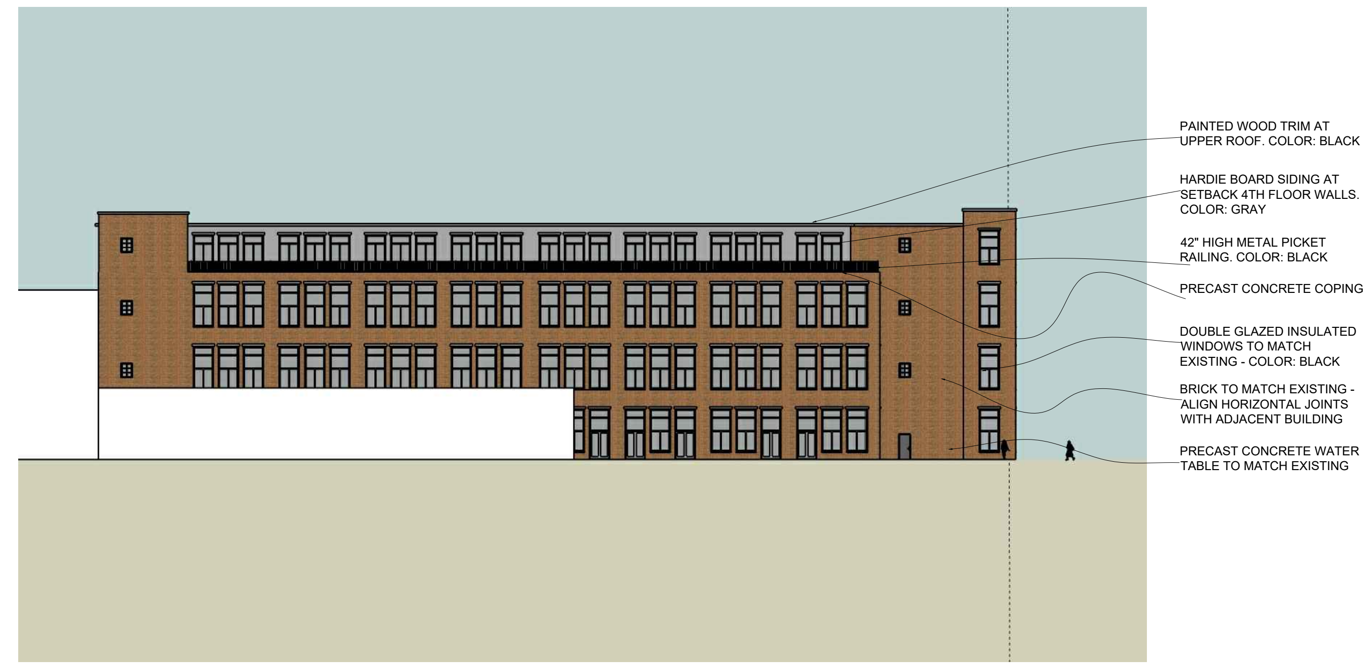
Elevation: Building 16: West Scale: 3/4" = 1'-0"