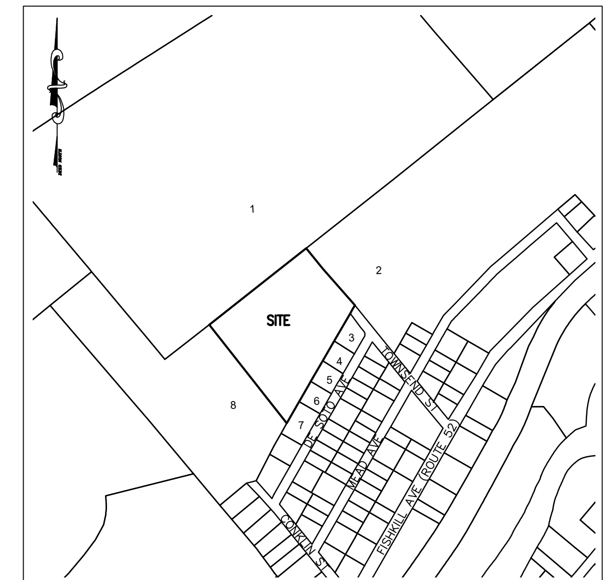
SITE LOCATION MAP SCALE: 1" = 400'