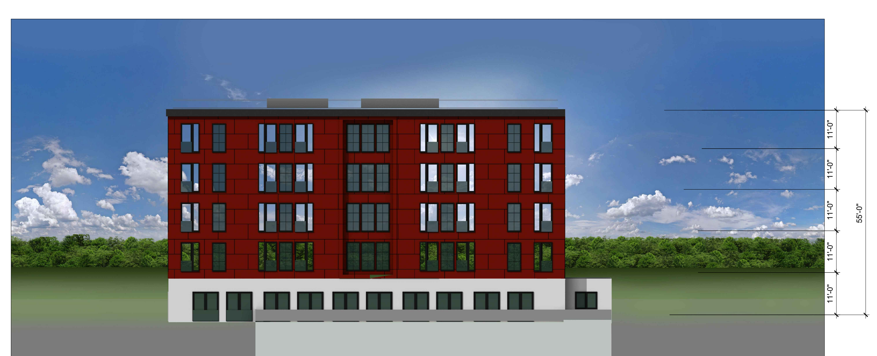
Building Elevation: Building 4