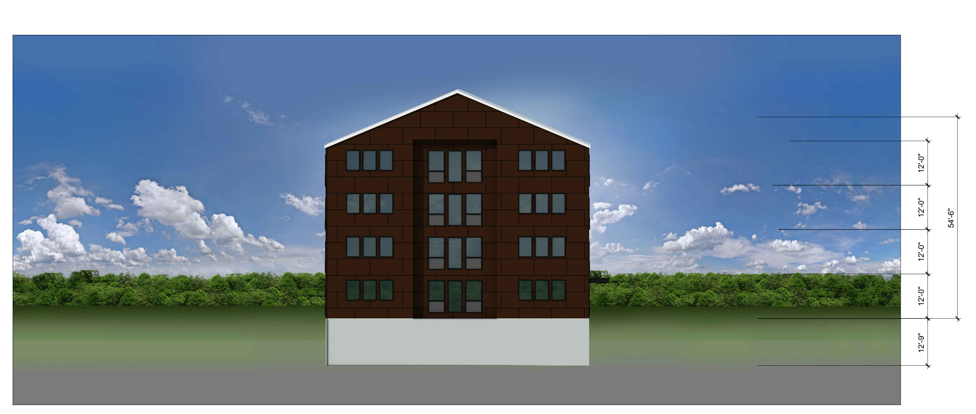
Building Elevation: Typical Gable Roof Building