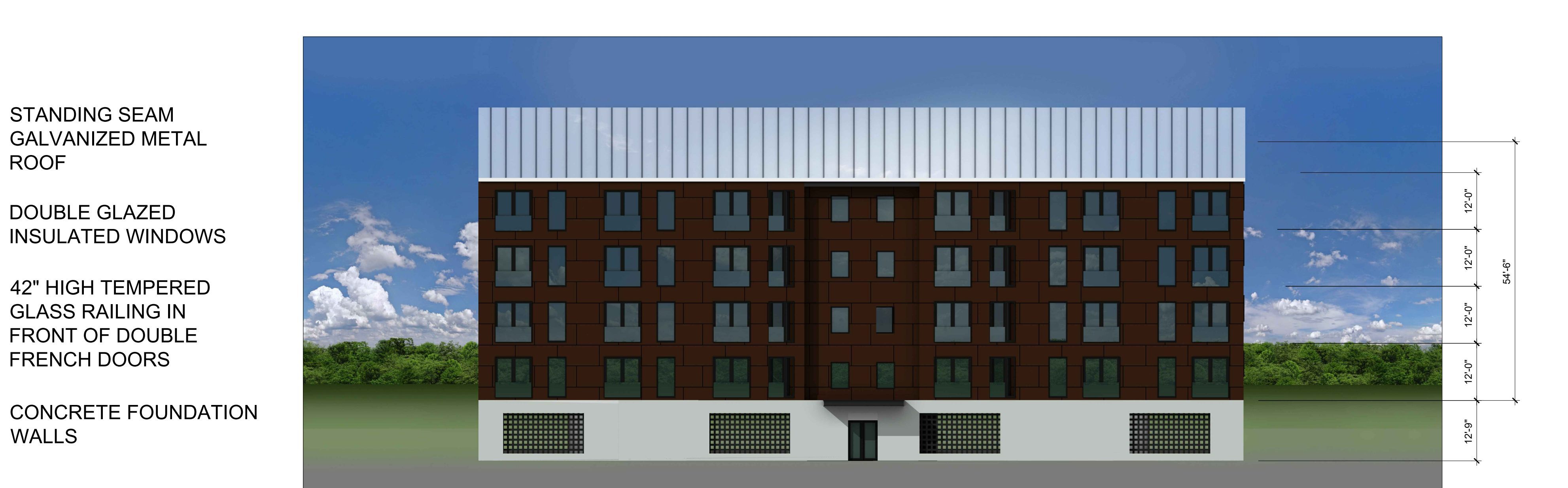
Building Elevation: Typical Gable Roof Building Over Podium