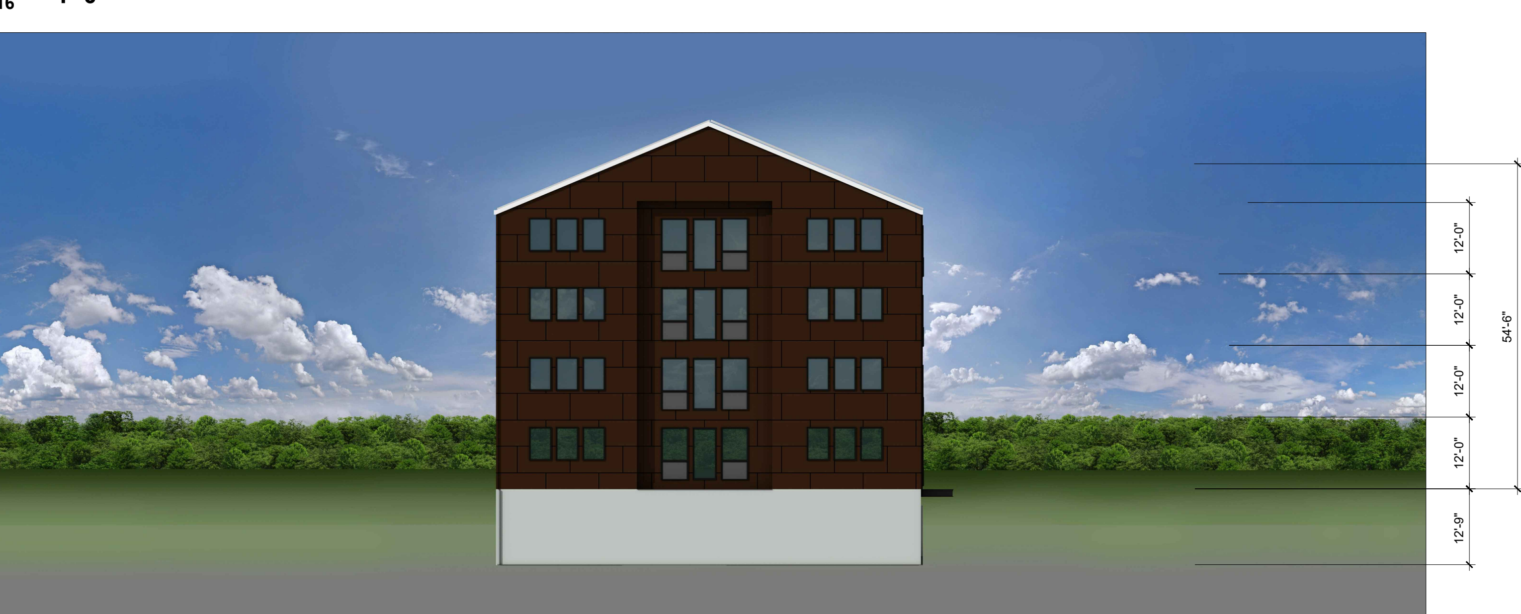
Building Elevation: Typical Gable Roof Building Over Podium \frac{1}{16} " = 1'-0"