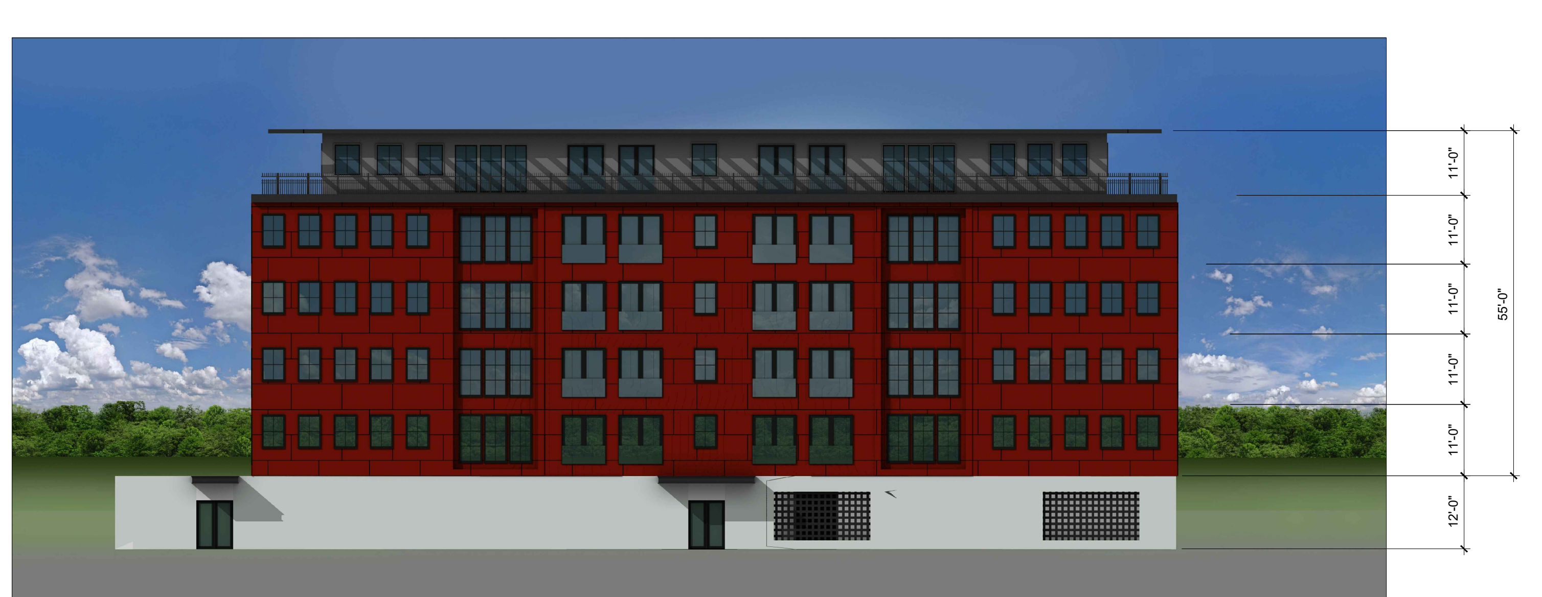
Building Elevation: Building 3