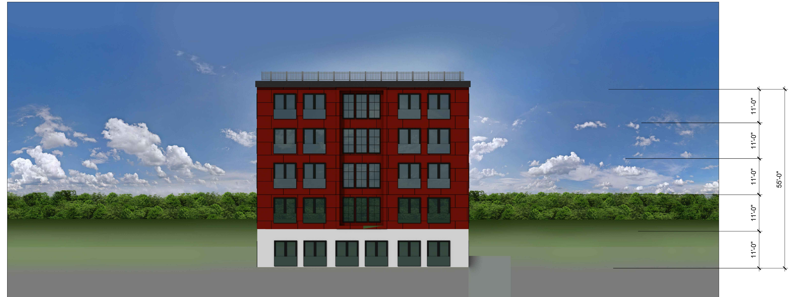
Building Elevation: Building 4