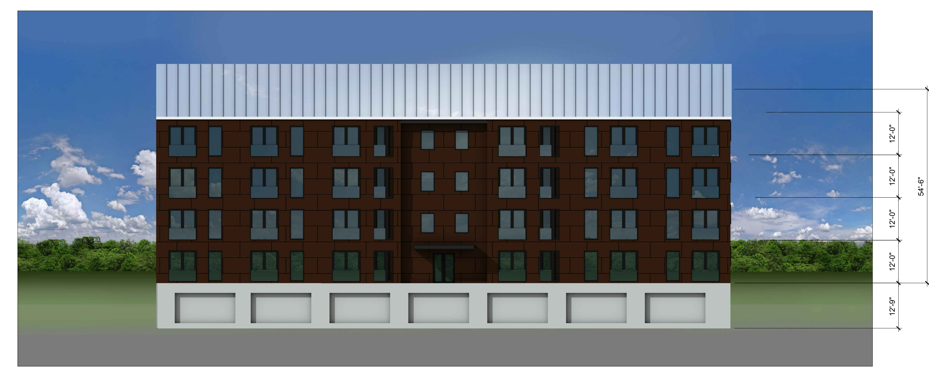
Building Elevation: Typical Gable Roof Building