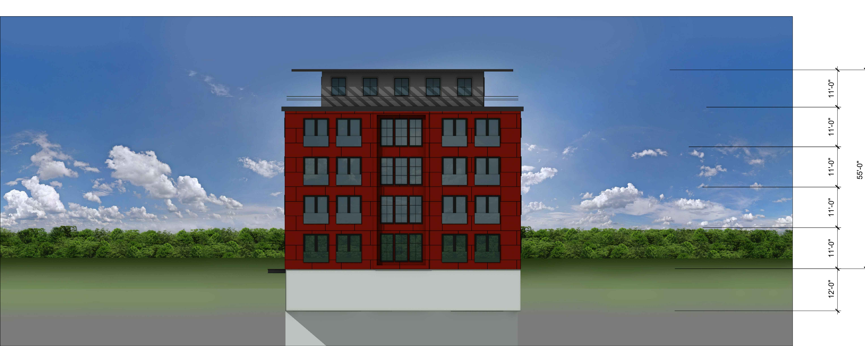
Building Elevation: Building 3