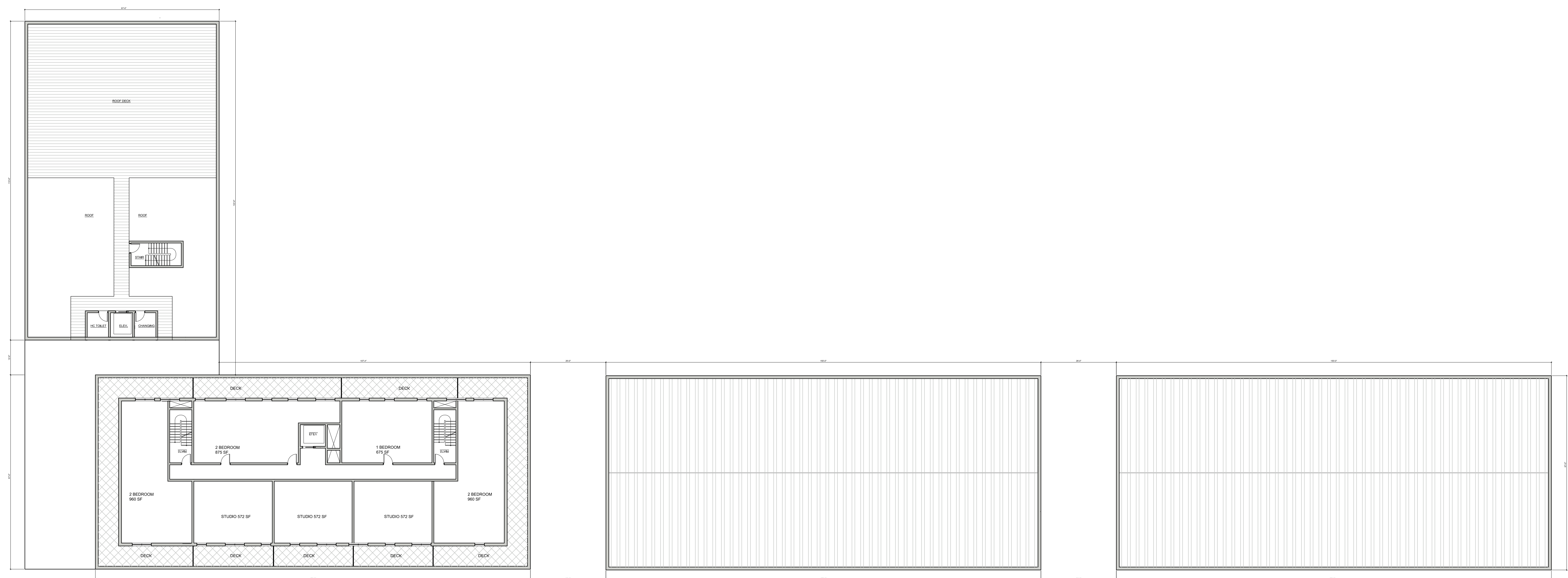
Scale: \frac{1}{16}" = 1'-0"