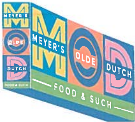
Sign perpendicular to the building

Sign designed as a box so that it has a face parallel to the building