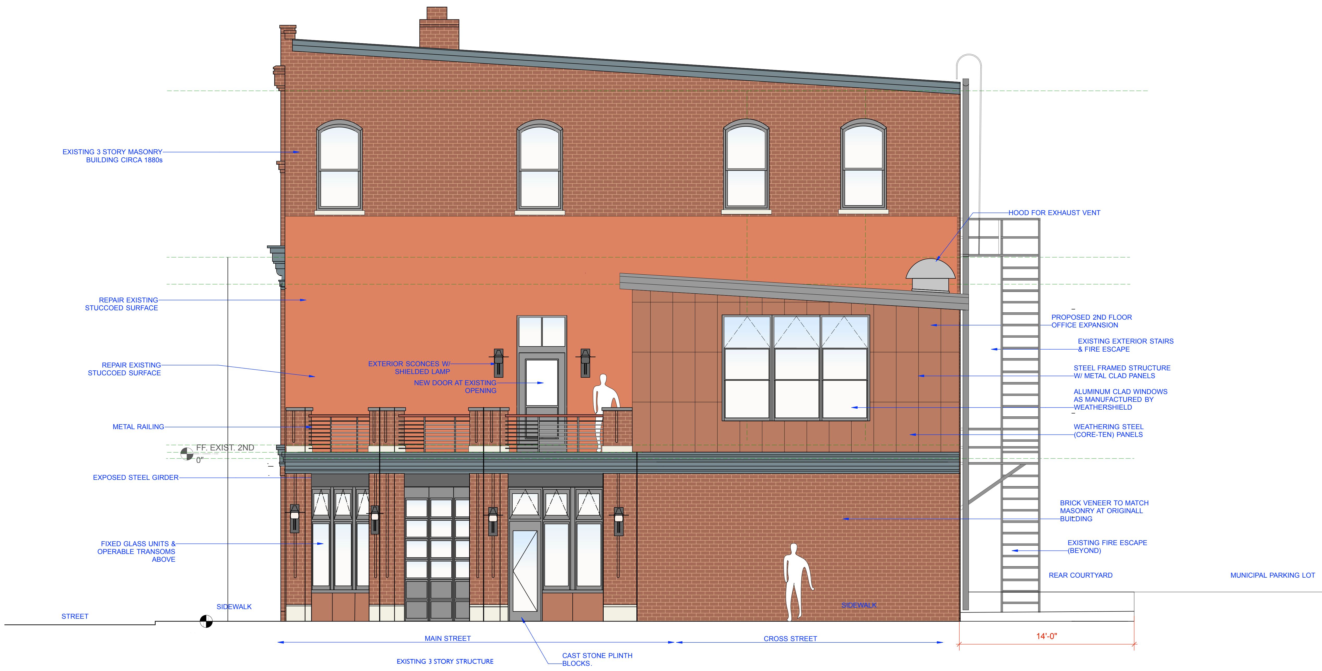
PROPOSED EAST ELEVATION Scale: 1/4" = 1'-0"