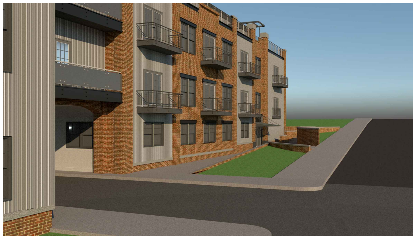
PERSPECTIVE - LOOKING UP WEST MAIN STREET