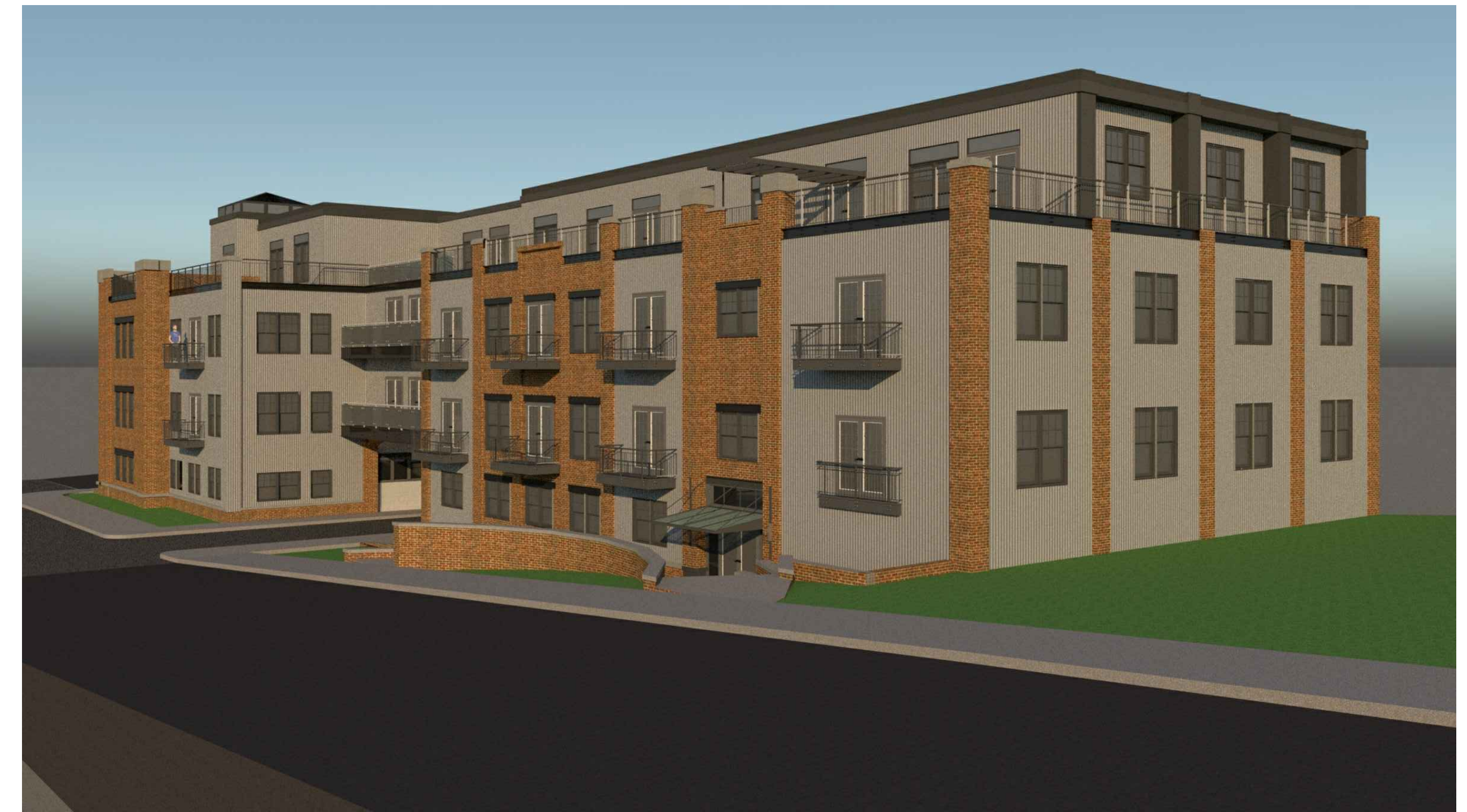
PERSPECTIVE - CORNER OF WEST MAIN STREET & BANK STREET

STANDING SEAM METAL SIDING. COLOR: GRAY PAINTED METAL RAILING. COLOR: BLACK CLAD ALUMINUM WINDOWS - ANDERSEN 400 SERIES OR APPROVED EQUAL. COLOR: BLACK BRICK SIDING - GLEN GARY 56DD OR APPROVED EQUAL HARDIE BOARD VERTICAL BOARD AND BATTEN SIDING. COLOR: IRON GRAY