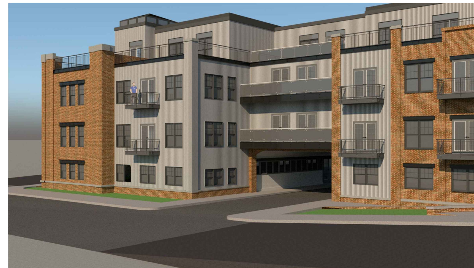
PERSPECTIVE - LOOKING ACROSS WEST MAIN STREET TO PORTE COCHERE ENTRY

APPLICANT/OWNER: FARRELL BUILDING COMPANY 2317 MONTAUK HIGHWAY BRIDGEHAMPTON, NY 11932 ARCHITECT: ARYEH SIEGEL ARCHITECT 84 MASON CIRCLE BEACON, NY 12508