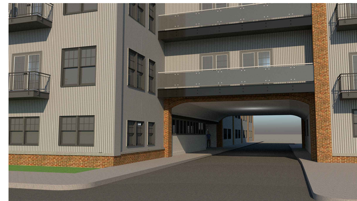
PERSPECTIVE - PORTE COCHERE ENTRY