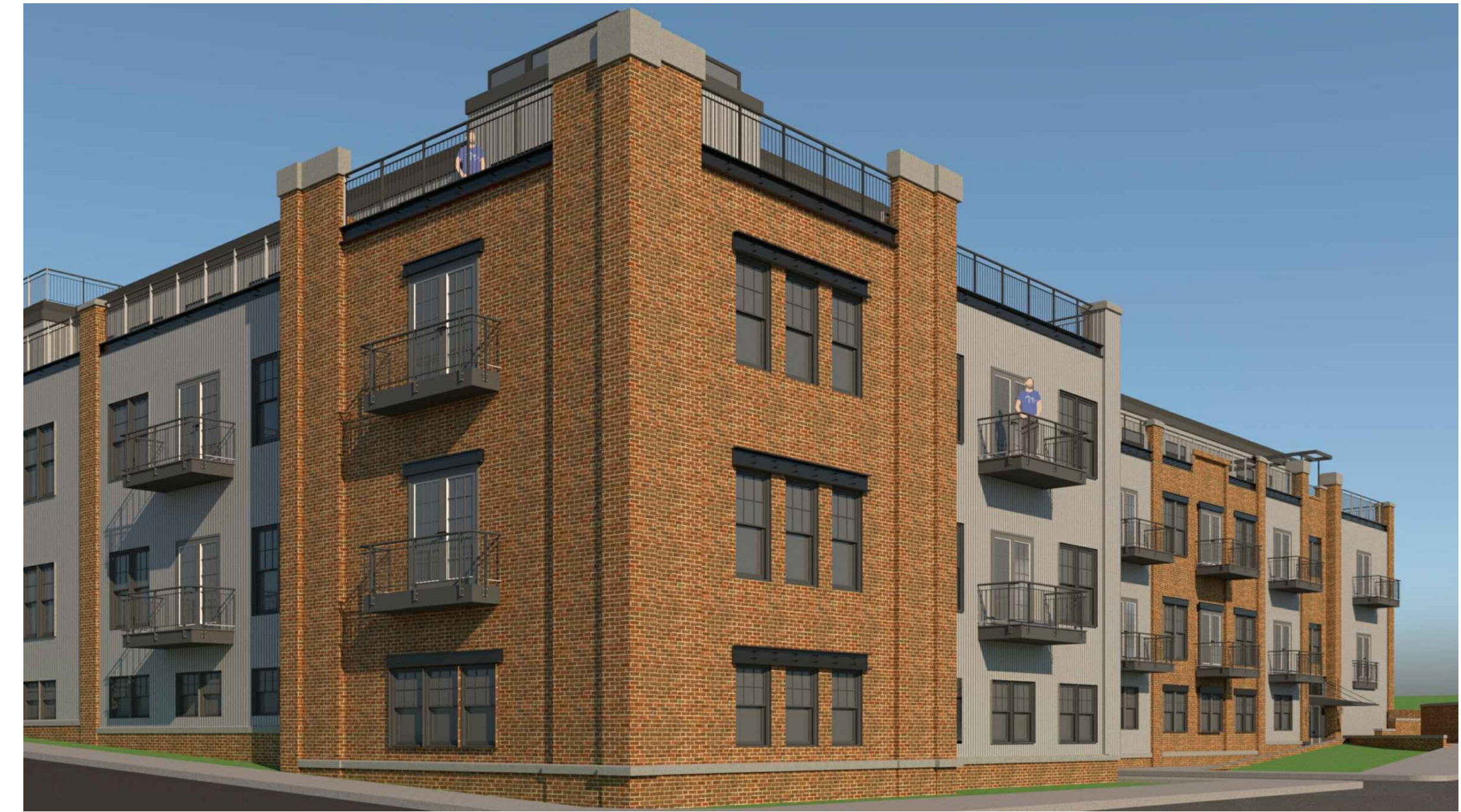
PERSPECTIVE - CORNER OF WEST MAIN STREET & BANK STREET

STANDING SEAM METAL SIDING. COLOR: GRAY PAINTED METAL RAILING. COLOR: BLACK CLAD ALUMINUM WINDOWS - ANDERSEN 400 SERIES OR APPROVED EQUAL. COLOR: BLACK BRICK SIDING - GLEN GARY 56DD OR APPROVED EQUAL HARDIE BOARD VERTICAL BOARD AND BATTEN SIDING. COLOR: IRON GRAY