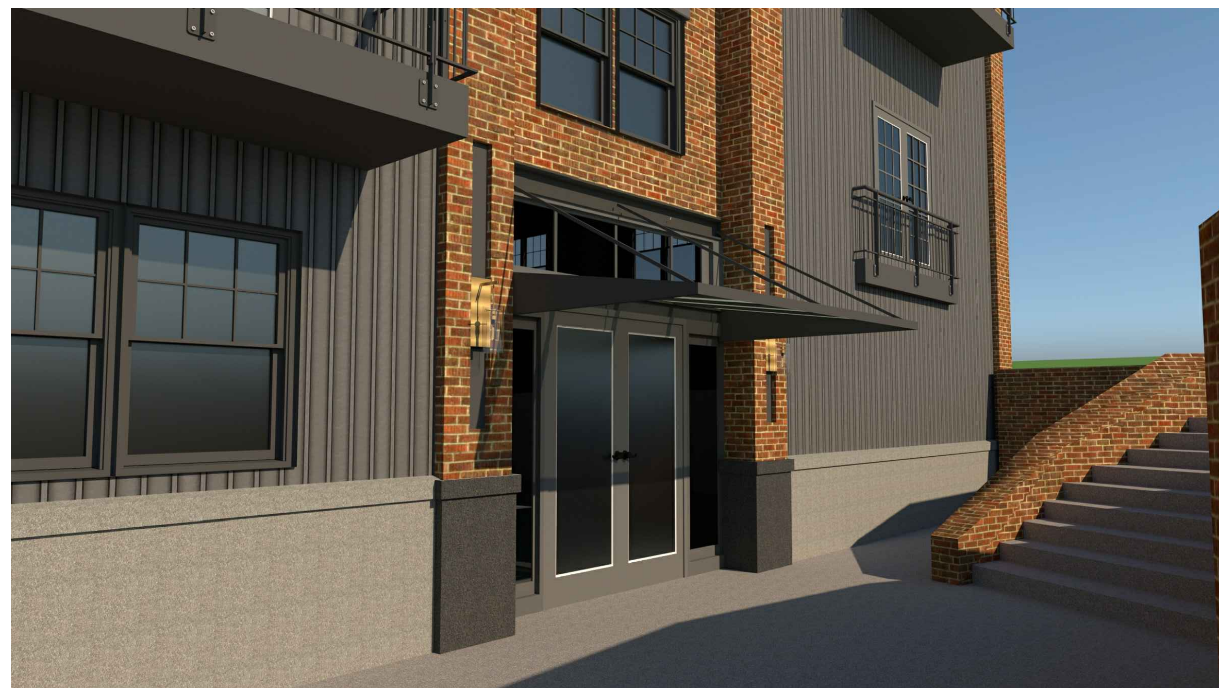
PERSPECTIVE - WEST MAIN STREET ENTRANCE