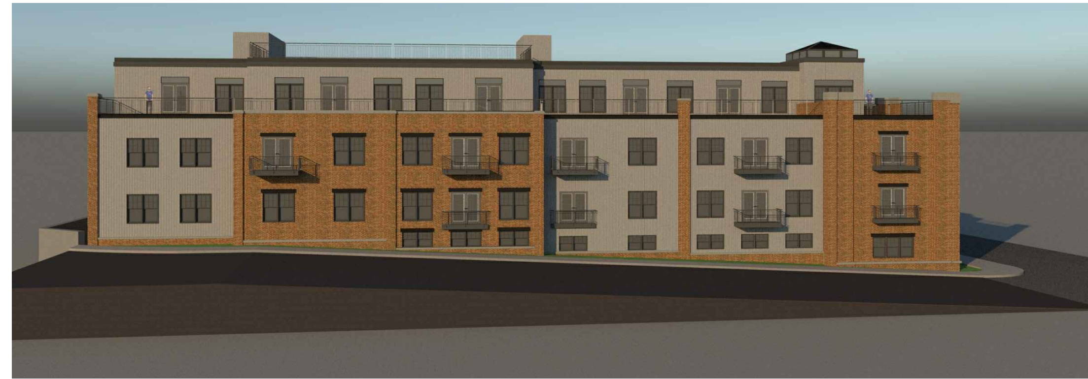
ELEVATION - BANK STREET

STANDING SEAM METAL SIDING. COLOR: GRAY PAINTED METAL RAILING. COLOR: BLACK CLAD ALUMINUM WINDOWS - ANDERSEN 400 SERIES OR APPROVED EQUAL. COLOR: BLACK BRICK SIDING - GLEN GARY 56DD OR APPROVED EQUAL HARDIE BOARD VERTICAL BOARD AND BATTEN SIDING. COLOR: IRON GRAY