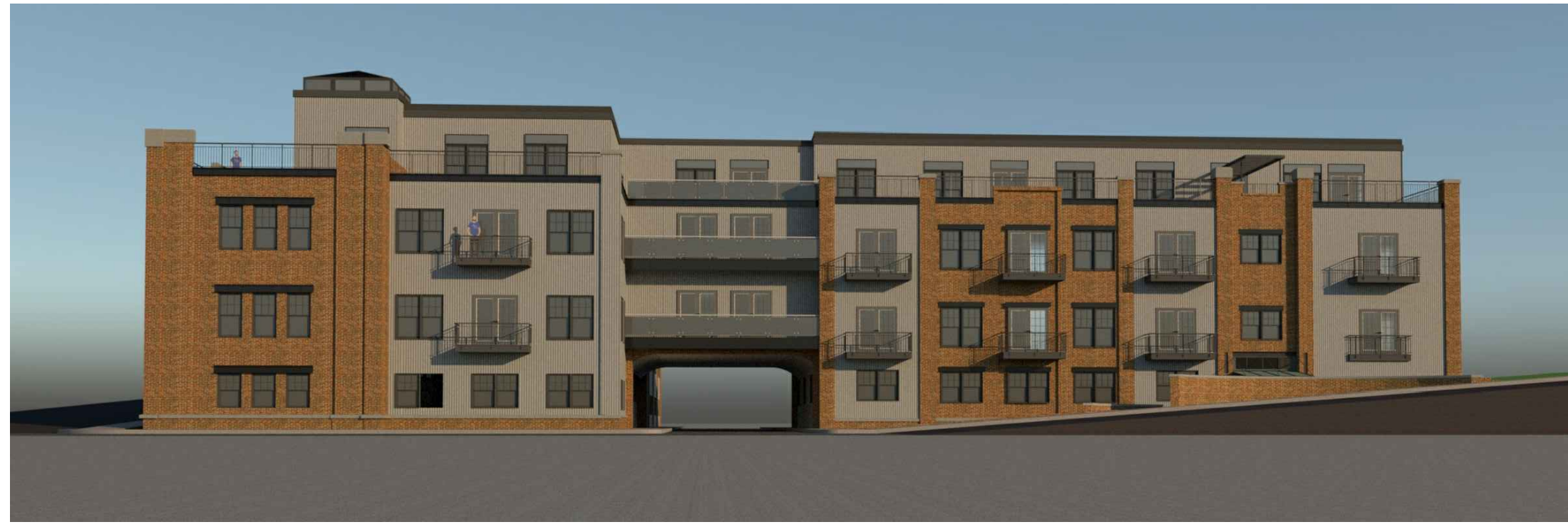
ELEVATION - WEST MAIN STREET

STANDING SEAM METAL SIDING. COLOR: GRAY PAINTED METAL RAILING. COLOR: BLACK CLAD ALUMINUM WINDOWS - ANDERSEN 400 SERIES OR APPROVED EQUAL. COLOR: BLACK BRICK SIDING - GLEN GARY 56DD OR APPROVED EQUAL HARDIE BOARD VERTICAL BOARD AND BATTEN SIDING. COLOR: IRON GRAY