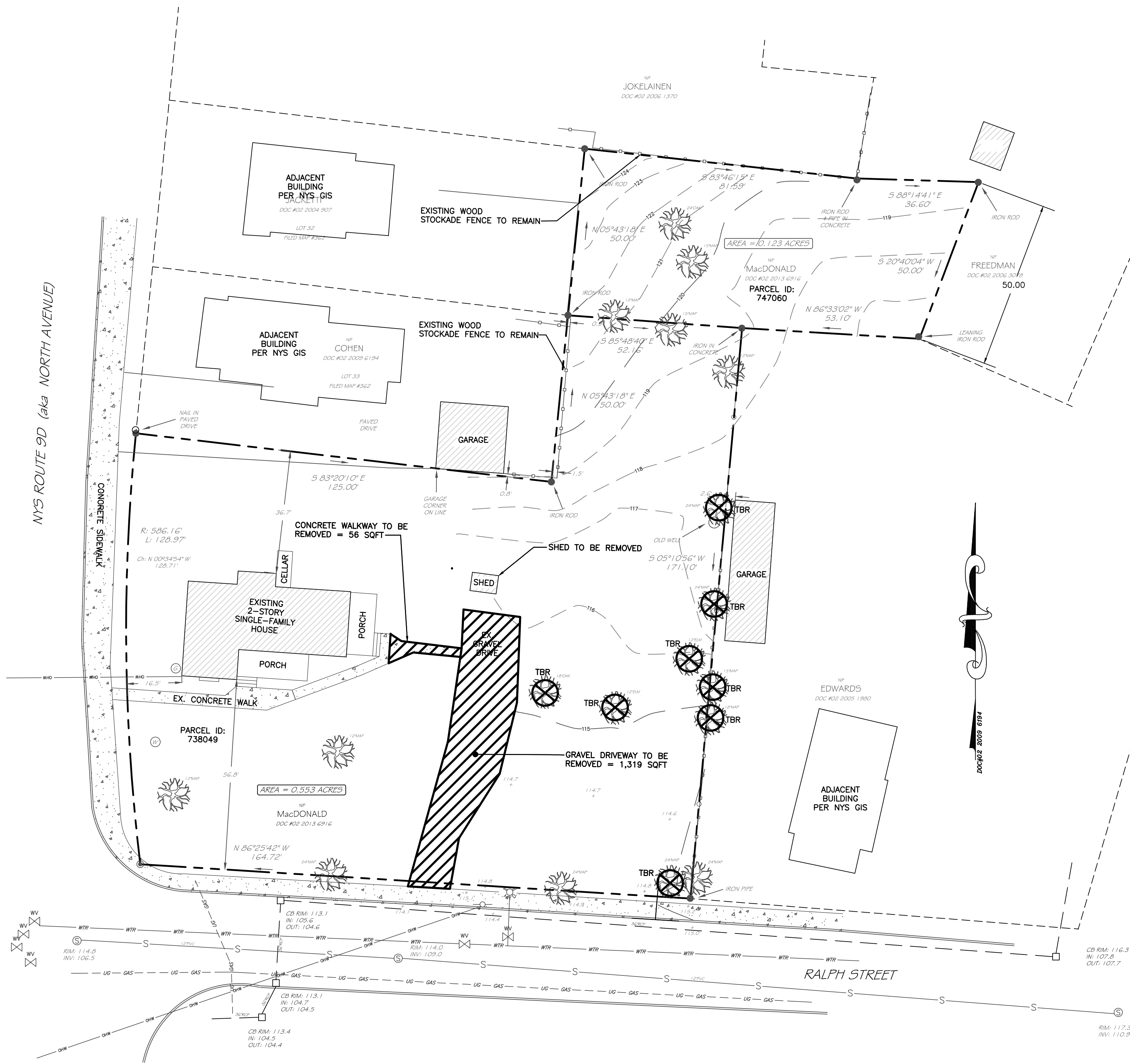
EXISTING CONDITIONS & REMOVAL PLAN SCALE: 1" = 20' GRAPHIC SCALE ( IN FEET ) 1 inch = 20 ft.