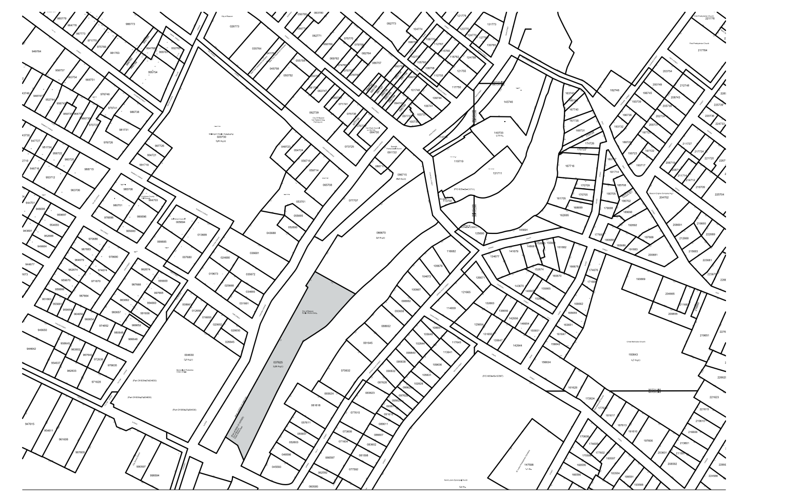
Location Map Scale: 1" = 400'