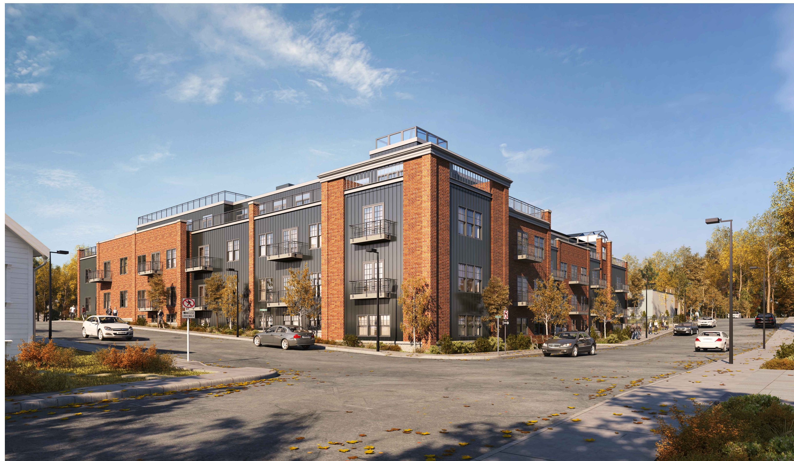
PERSPECTIVE - CORNER OF WEST MAIN & BANK ST.