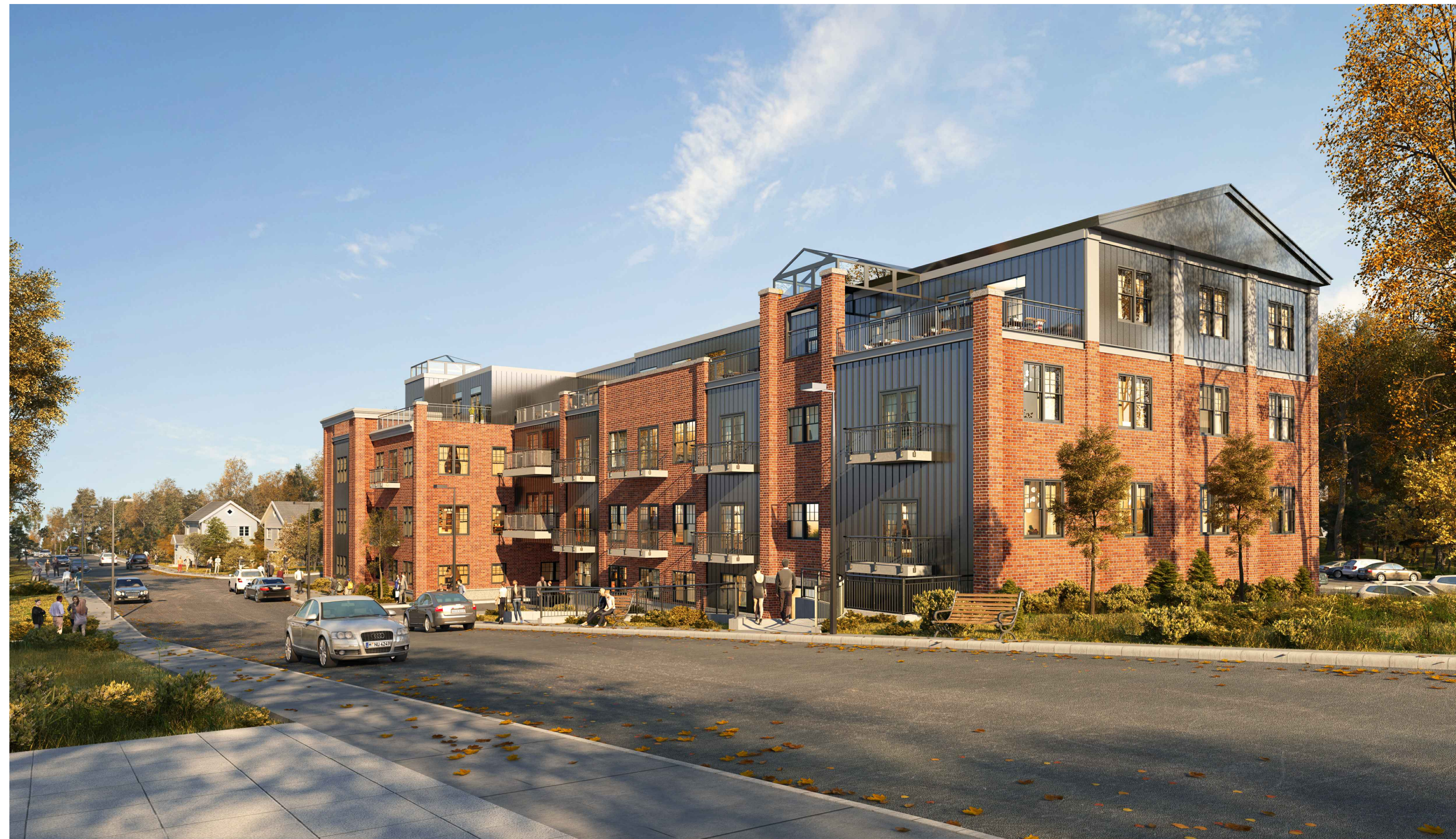
PERSPECTIVE - LOOKING DOWN WEST MAIN ST.

APPLICATION OWNER: FARRELL BUILDING COMPANY 2317 MONTAUK HIGHWAY BRIDGEHAMPTON, NY 11932 ARCHITECT: ARYEH SIEGEL ARCHITECT 84 MASON CIRCLE BEACON, NY 12508