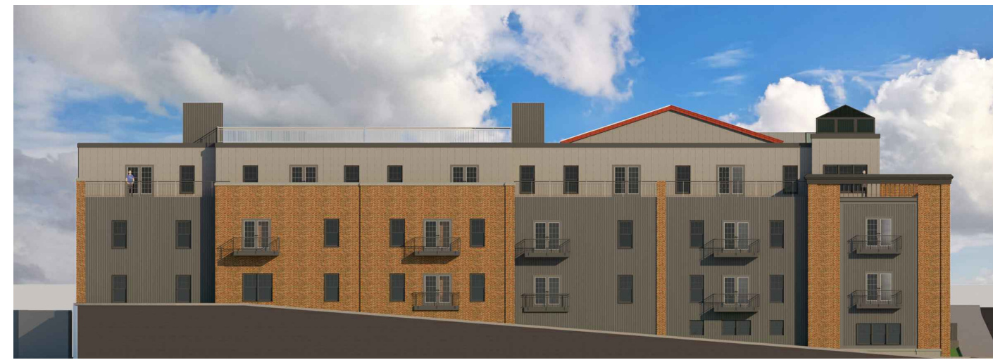
BANK ST. ELEVATION

STANDING SEAM METAL ROOF. COLOR: GRAY STANDING SEAM METAL SIDING. COLOR: GRAY PAINTED METAL RAILING. COLOR: BLACK CLAD ALUMINUM WINDOWS - ANDERSEN 400 SERIES OR APPROVED EQUAL. COLOR: BLACK BRICK SIDING - GLEN GARY 56DD OR APPROVED EQUAL HARDIE BOARD VERTICAL BOARD AND BATTEN SIDING. COLOR: IRON GRAY