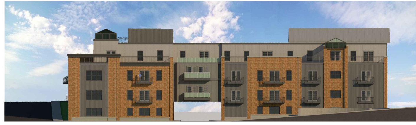
WEST MAIN ST. ELEVATION

STANDING SEAM METAL ROOF. COLOR: GRAY STANDING SEAM METAL SIDING. COLOR: GRAY PAINTED METAL RAILING. COLOR: BLACK CLAD ALUMINUM WINDOWS - ANDERSEN 400 SERIES OR APPROVED EQUAL. COLOR: BLACK BRICK SIDING - GLEN GARY 56DD OR APPROVED EQUAL HARDIE BOARD VERTICAL BOARD AND BATTEN SIDING. COLOR: IRON GRAY