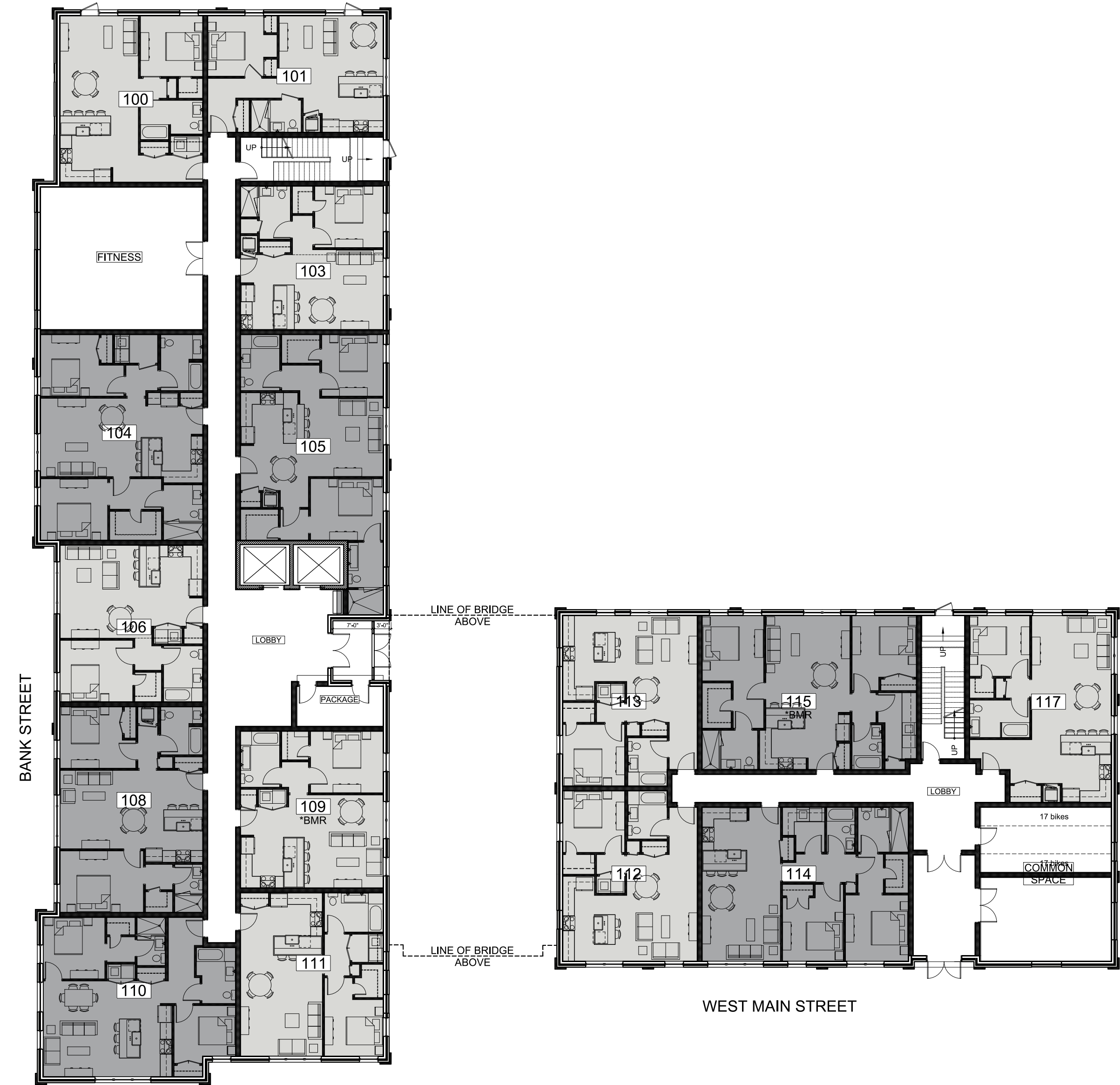
1st Floor Plan 9 - 1 Bedroom 6 - 2 Bedroom