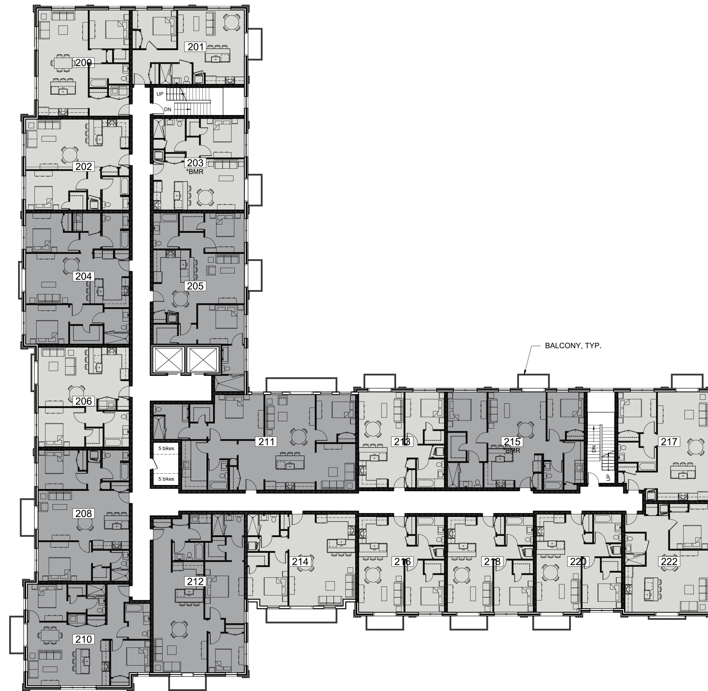
2nd Floor Plan 12 - 1 Bedroom 7 - 2 Bedroom

COPYRIGHT © 2019 BY JMC. All Rights Reserved. No part of this document may be reproduced, stored in a retrieval system, or transmitted in any form or by any means, electronic, mechanical, photocopying, recording or otherwise, without the prior written permission of JMC PLANNING, ENGINEERING, LANDSCAPE ARCHITECTURE & LAND SURVEYING, PLLC AND SURVEYING & LAND DEVELOPMENT CONSULTANTS, LLC. JOHN MEYER CONSULTING, INC. Any modification or alterations to this document without the written permission of JMC shall render them null and void.