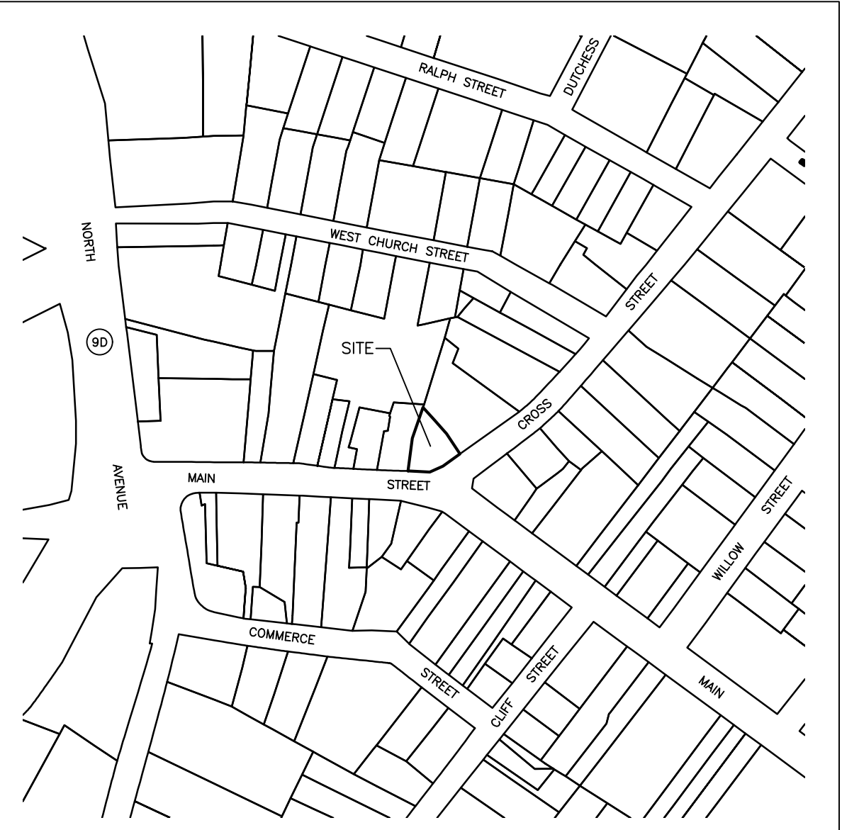
SITE LOCATION MAP: SCALE = 1"=200'