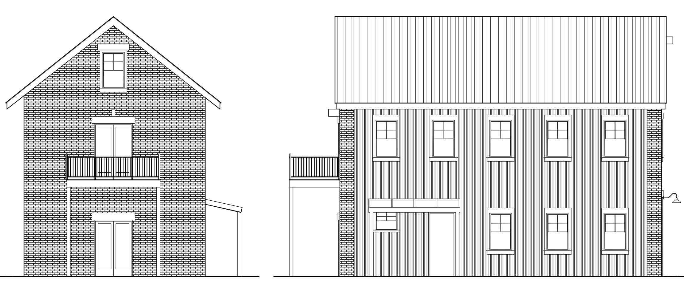
Elevation: South \frac{1}{8} " = 1'-0"