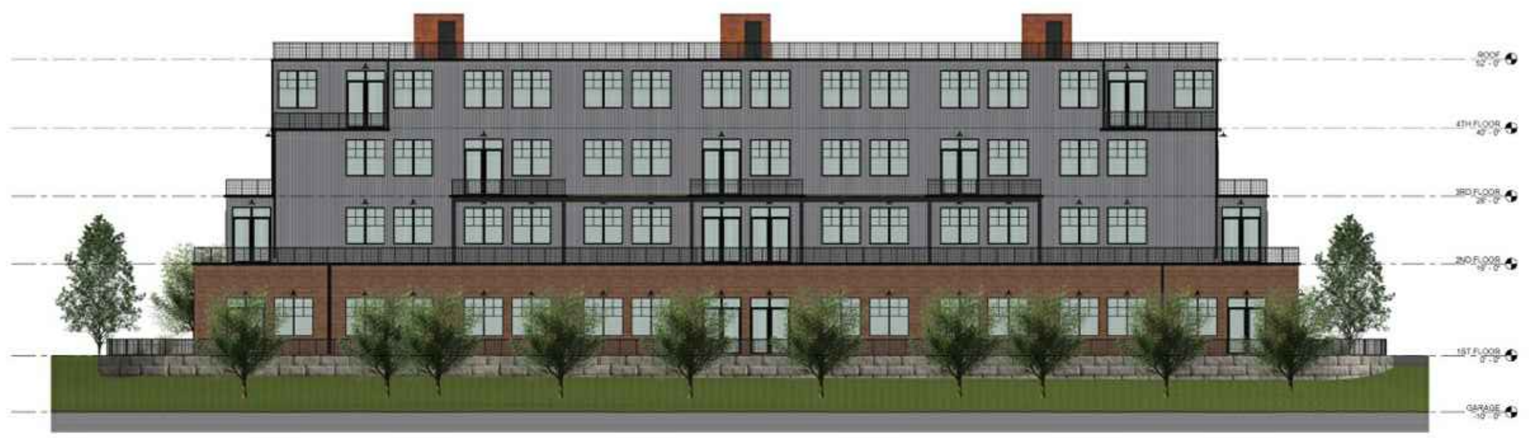
Elevation: East \frac{1}{16} " = 1'-0" ------BALCONY: CONCRETE DECK WITH PAINTED STEEL EDGE AND COLUMNS. COLOR: BLACK Elevation: North (South Similar) \frac{1}{16} " = 1'-0"