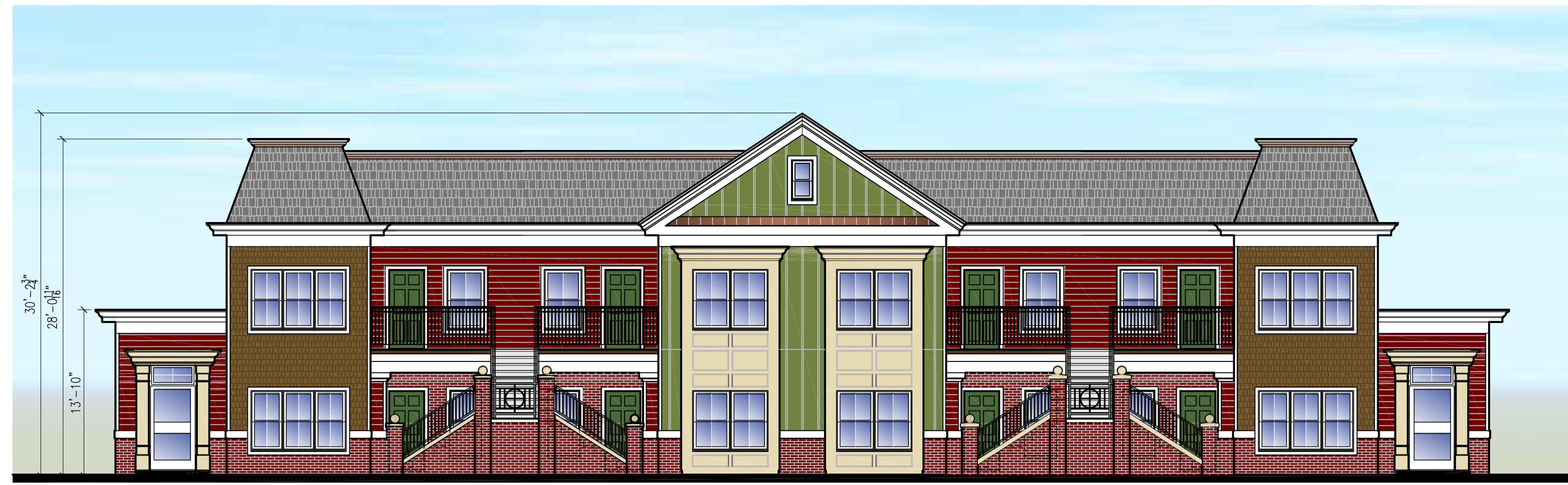
WEST ELEVATION - BUILDINGS 200 & 400