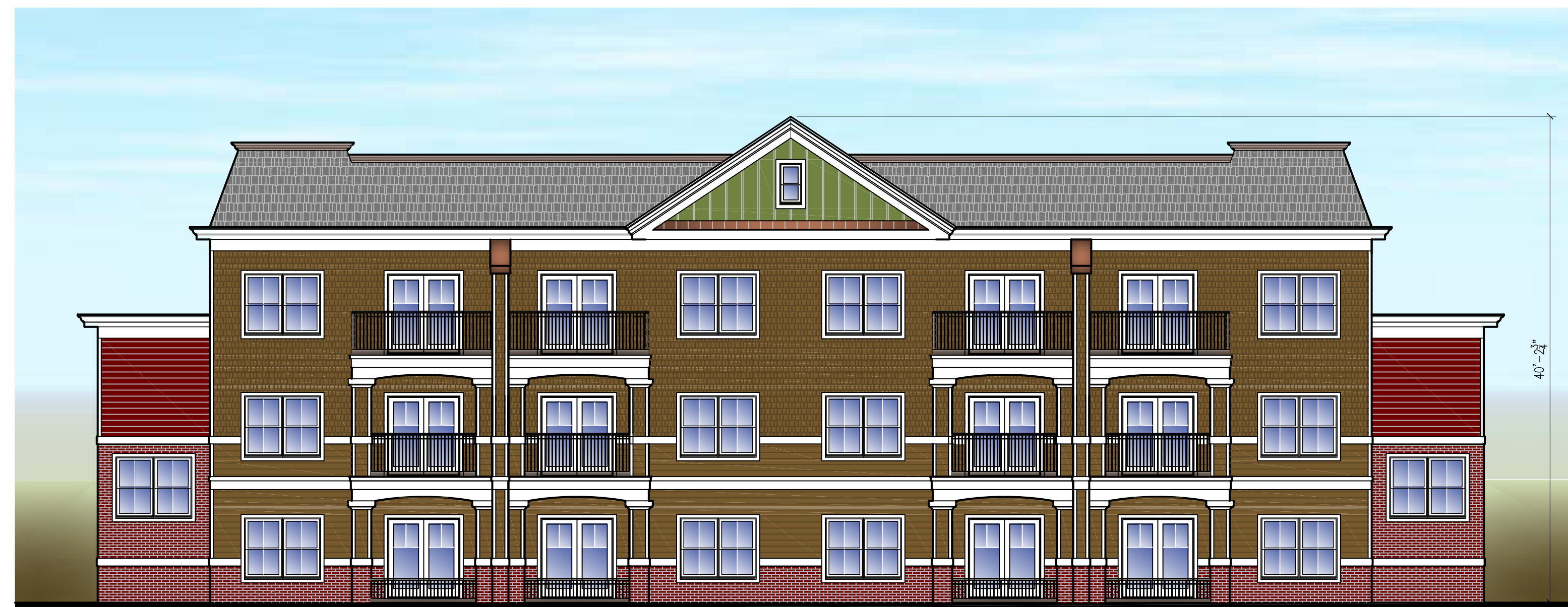
EAST ELEVATION - BUILDINGS 200 & 400