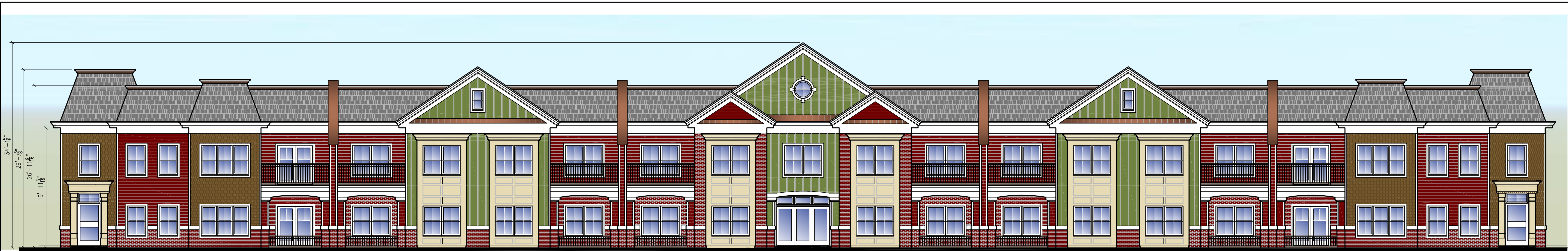
WEST ELEVATION - BUILDINGS 100 & 300