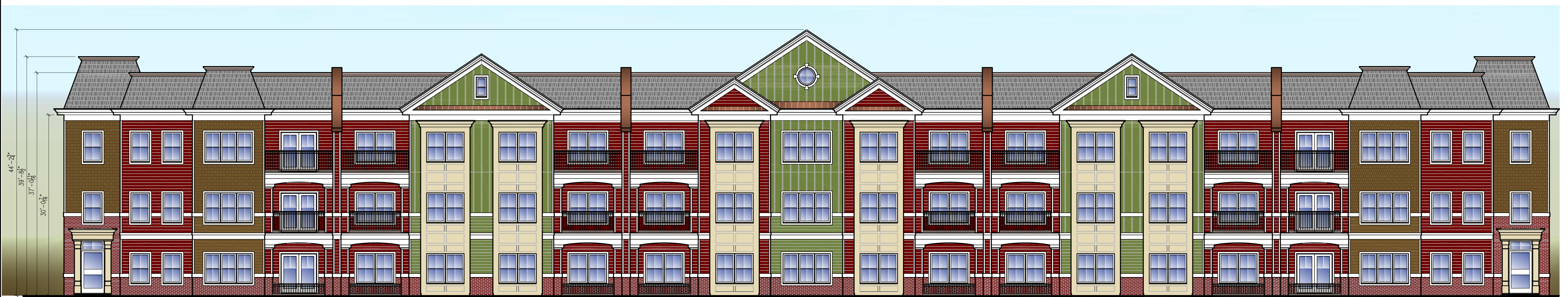
EAST ELEVATION - BUILDINGS 100 & 300

TIORONDA AVENUE - CITY OF BEACON, NEW YORK