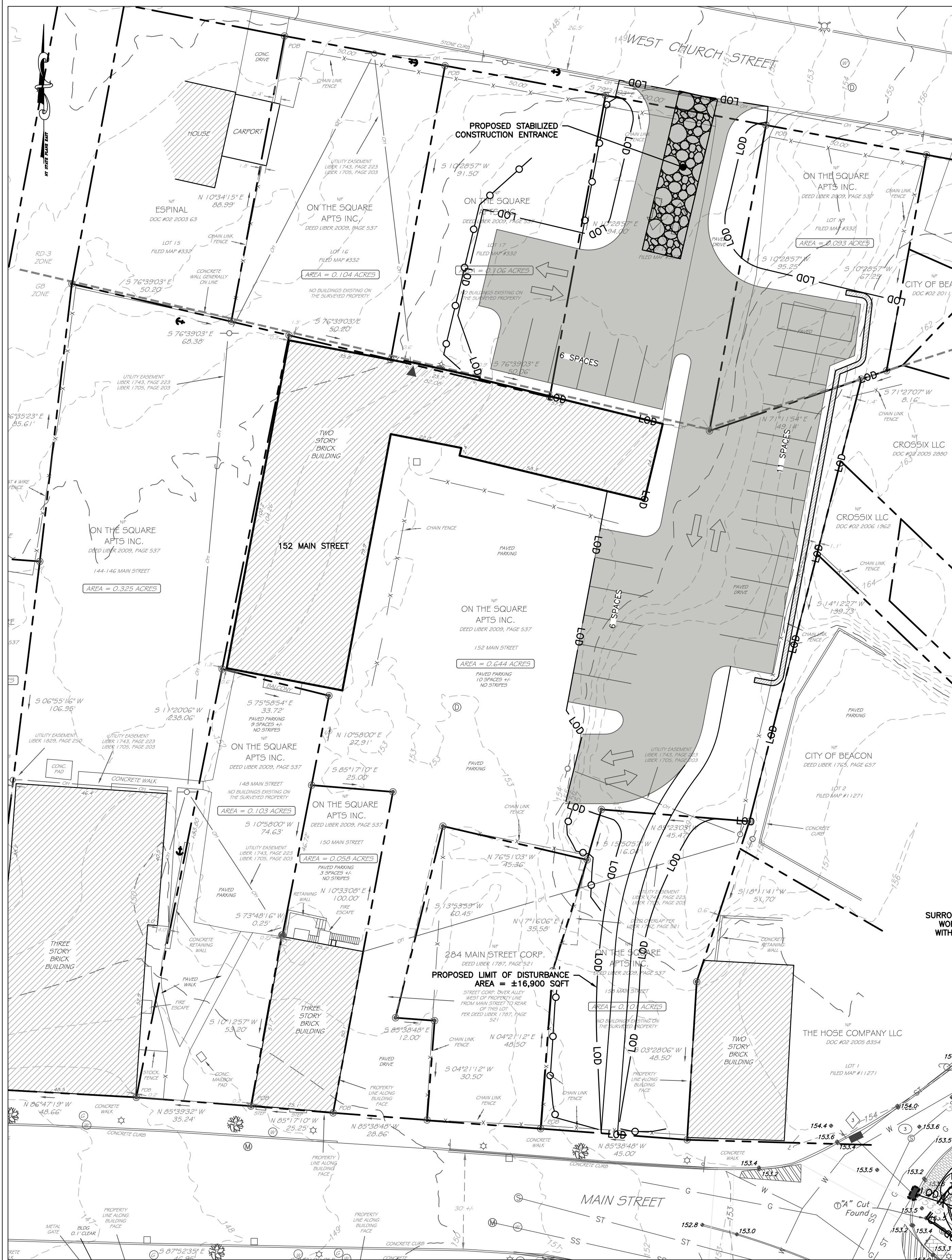
OFFSITE PARKING EROSION & SEDIMENT CONTROL PLAN SCALE: 1" = 20'