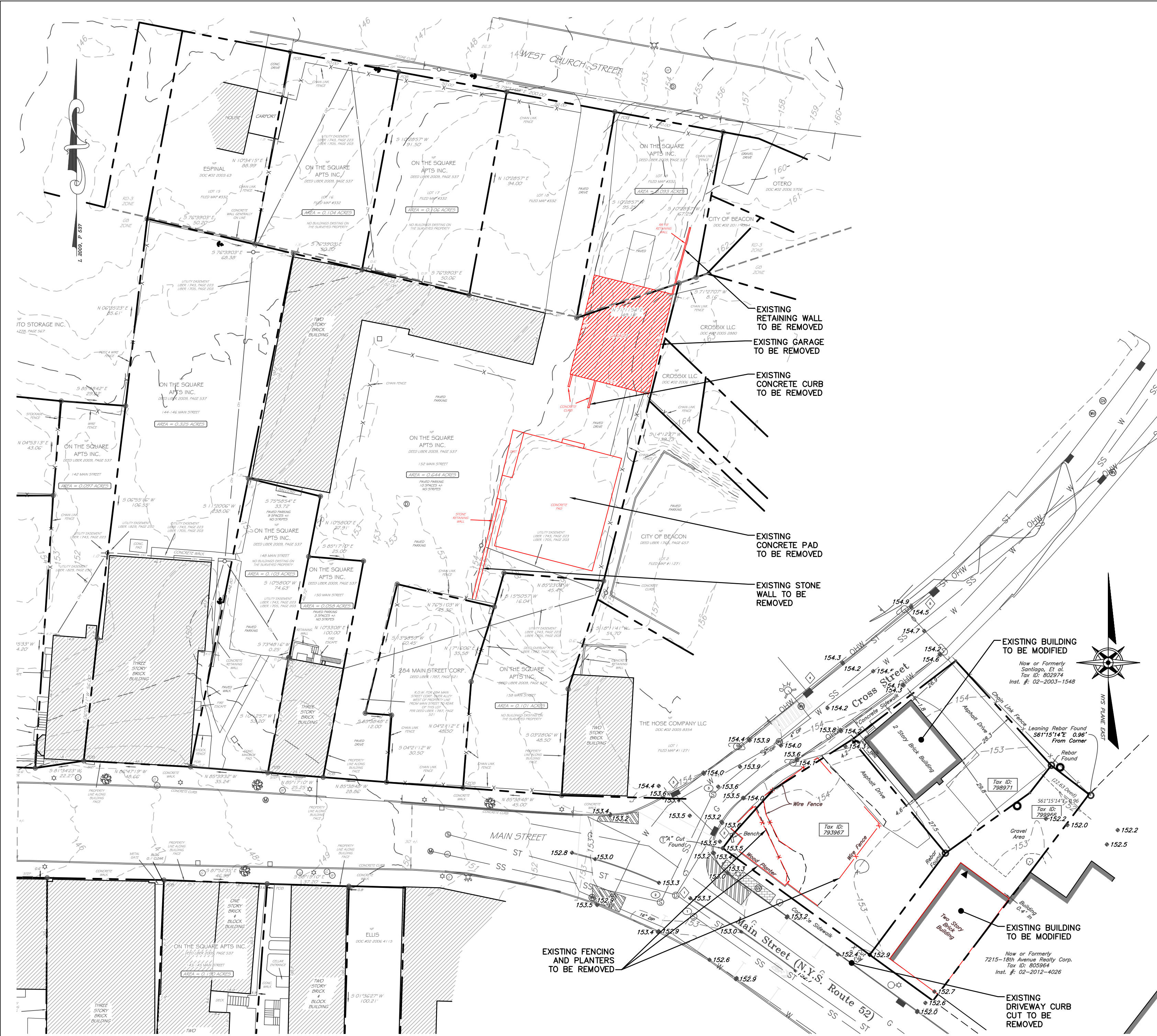
LEGEND EXISTING CONDITIONS AND REMOVALS PLAN SCALE: 1" = 30'