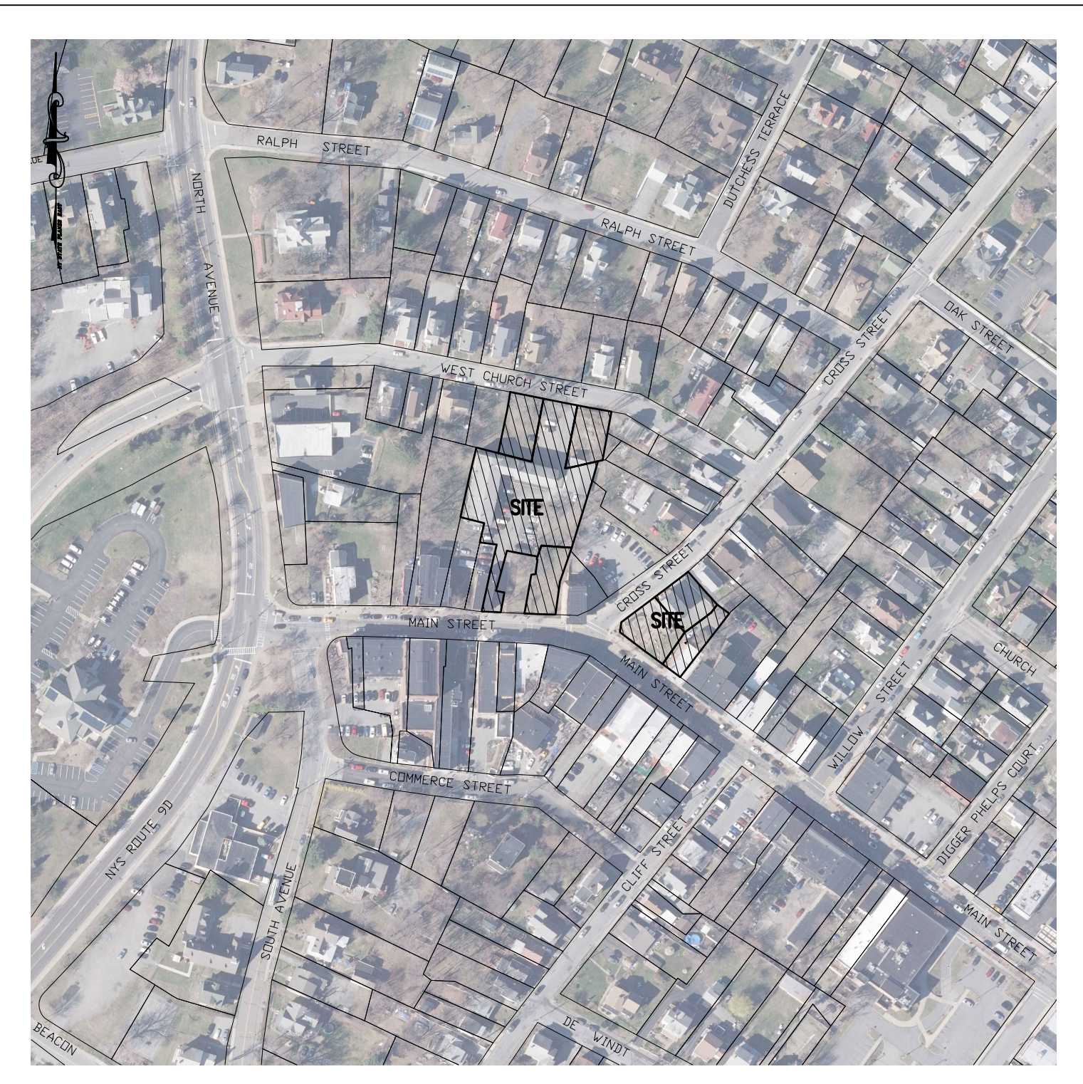
LOCATION MAP SCALE: 1" = 400'