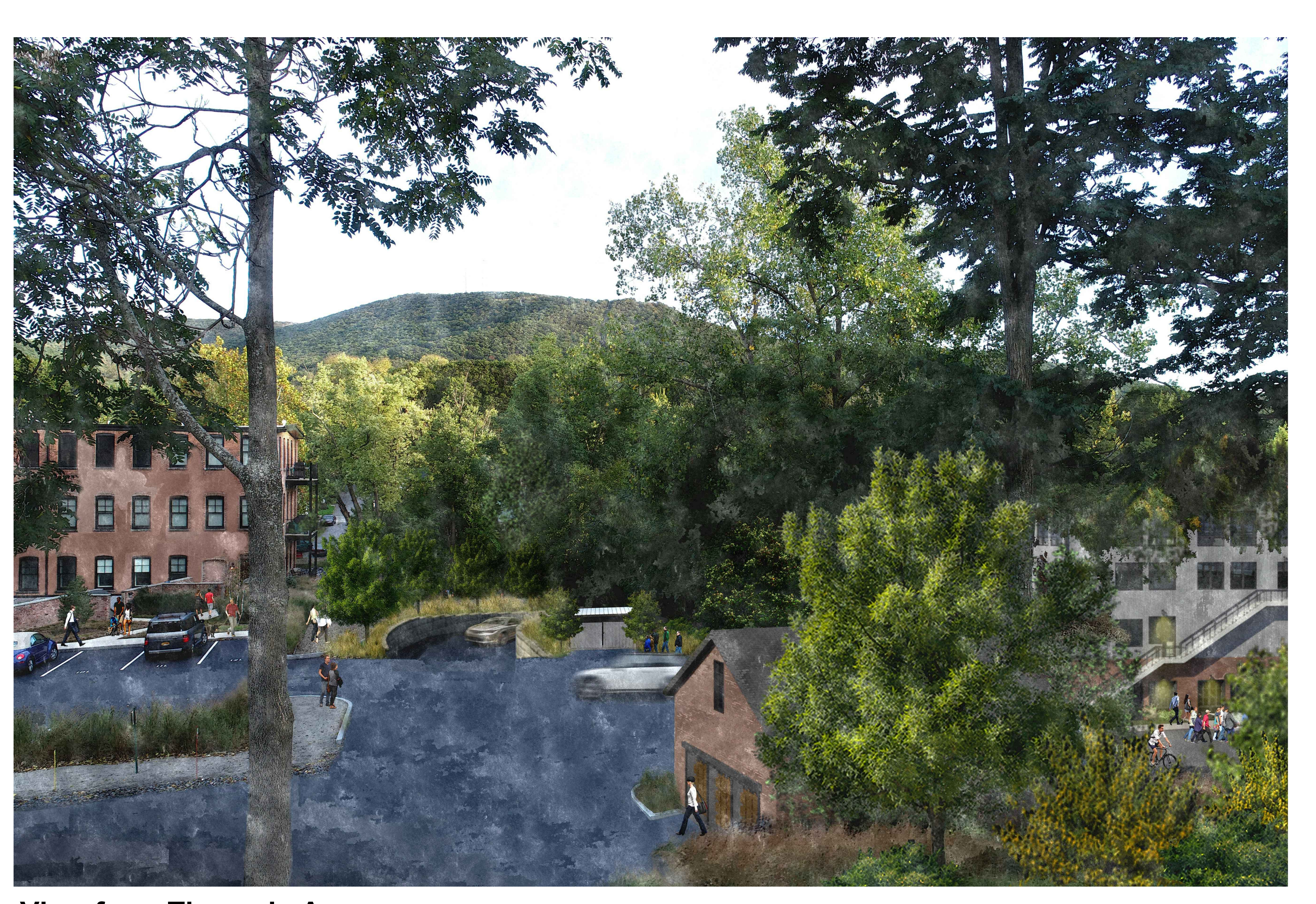
View from Tioronda Avenue