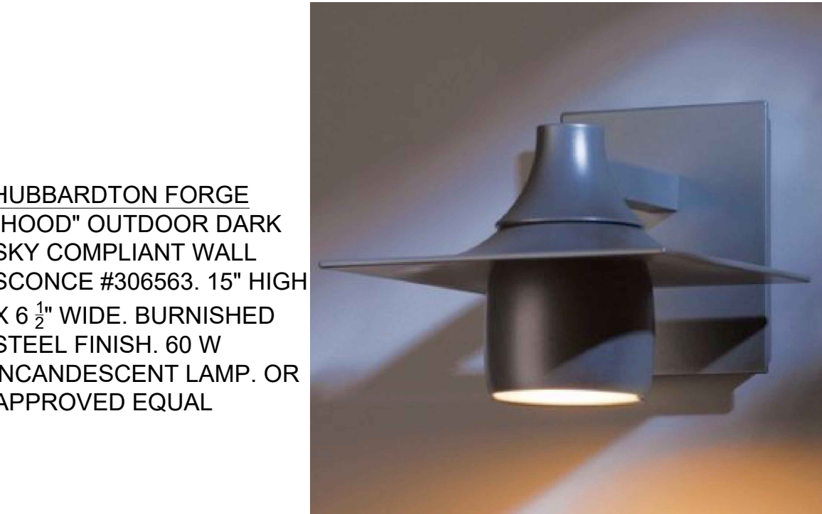
L1: Wall Mounted

NOTE: ALL EXTERIOR LIGHTING ON THE SITE SHALL BE DIRECTED AND/OR SHIELDED SO AS NOT TO CAUSE ANY OBJECTIONABLE GLARE OBSERVABLE FROM NEIGHBORING STREETS AND PROPERTIES. THE SOURCE (BULBS) OF SUCH LIGHTING SHALL NOT BE VISIBLE FROM SAID NEIGHBORING STREETS AND PROPERTIES. PHOTOMETRIC DIAGRAMS ARE SHOWN WITH SHIELDED CONDITIONS.