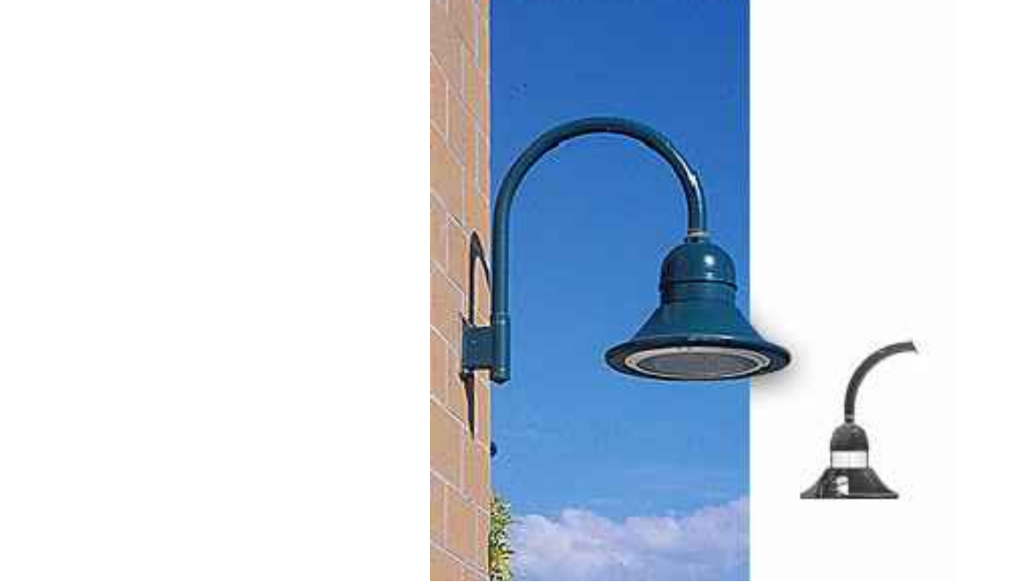
WALL MOUNTED LIGHT (L2) SELUX LIGHTING "BETA PENDANT" WALL MOUNTED FIXTURE, MODEL #BPC-L-R2-1-H50-BK-120-HS-PC WITH LOW GLARE CUTOFF SHIELD, COLOR: BLACK, PHOTOCELL CONTROL, OR APPROVED EQUAL. MOUNTING HEIGHT = 12 FEET

NOTE: ALL EXTERIOR LIGHTING ON THE SITE SHALL BE DIRECTED AND/OR SHIELDED SO AS NOT TO CAUSE ANY OBJECTIONABLE GLARE OBSERVABLE FROM NEIGHBORING STREETS AND PROPERTIES. THE SOURCE (BULBS) OF SUCH LIGHTING SHALL NOT BE VISIBLE FROM SAID NEIGHBORING STREETS AND PROPERTIES. PHOTOMETRIC DIAGRAMS ARE SHOWN WITH SHIELDED CONDITIONS.