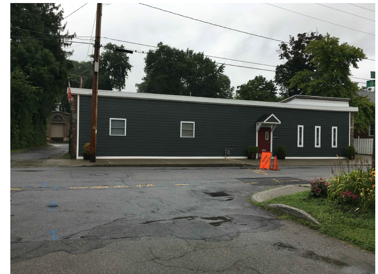
Photo of Existing Building at Eliza Street