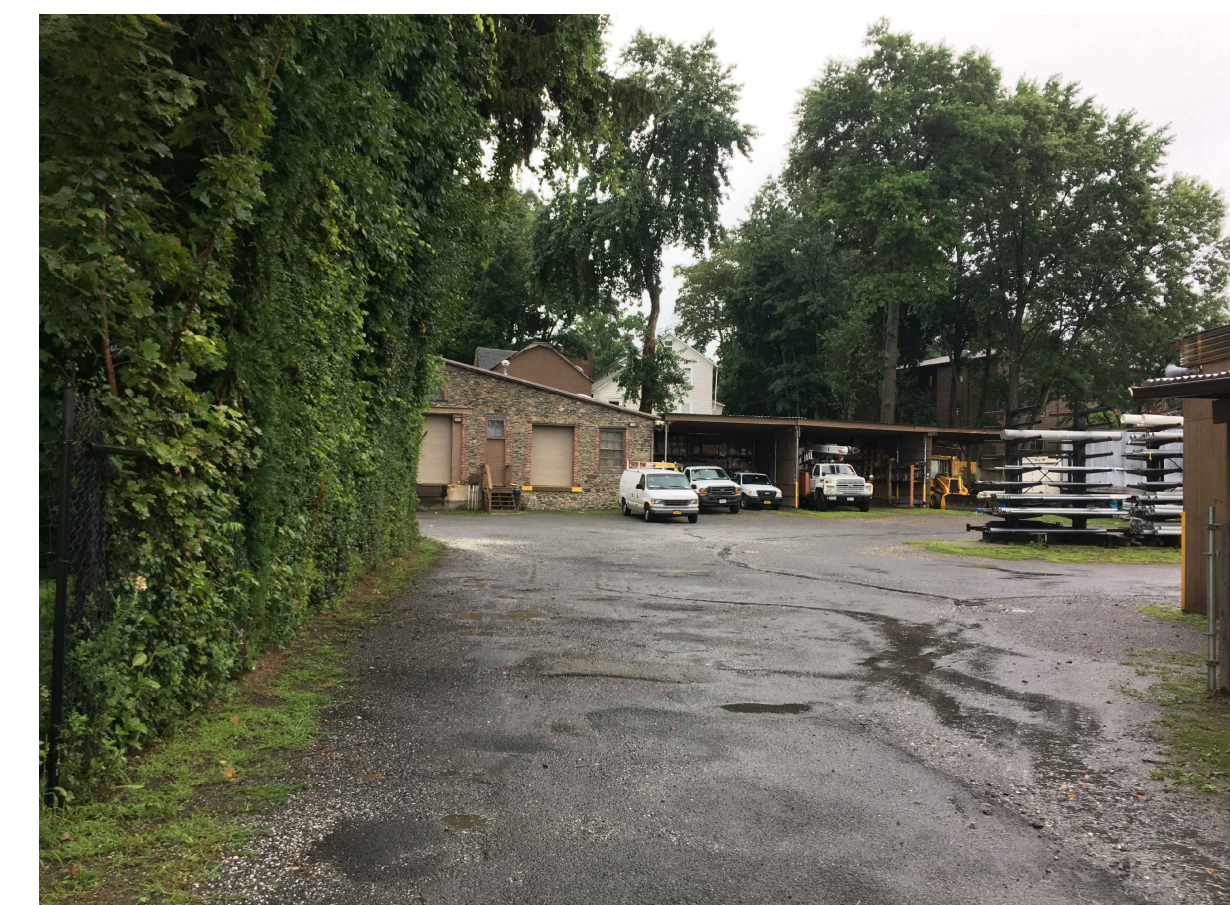
Photo of Existing Yard