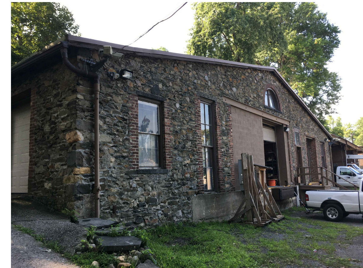
Photo of Existing Stone Building

Survey Date: July 23, 2018 TEC Land Surveying 15C Tioronda Avenue Beacon, New York 12508