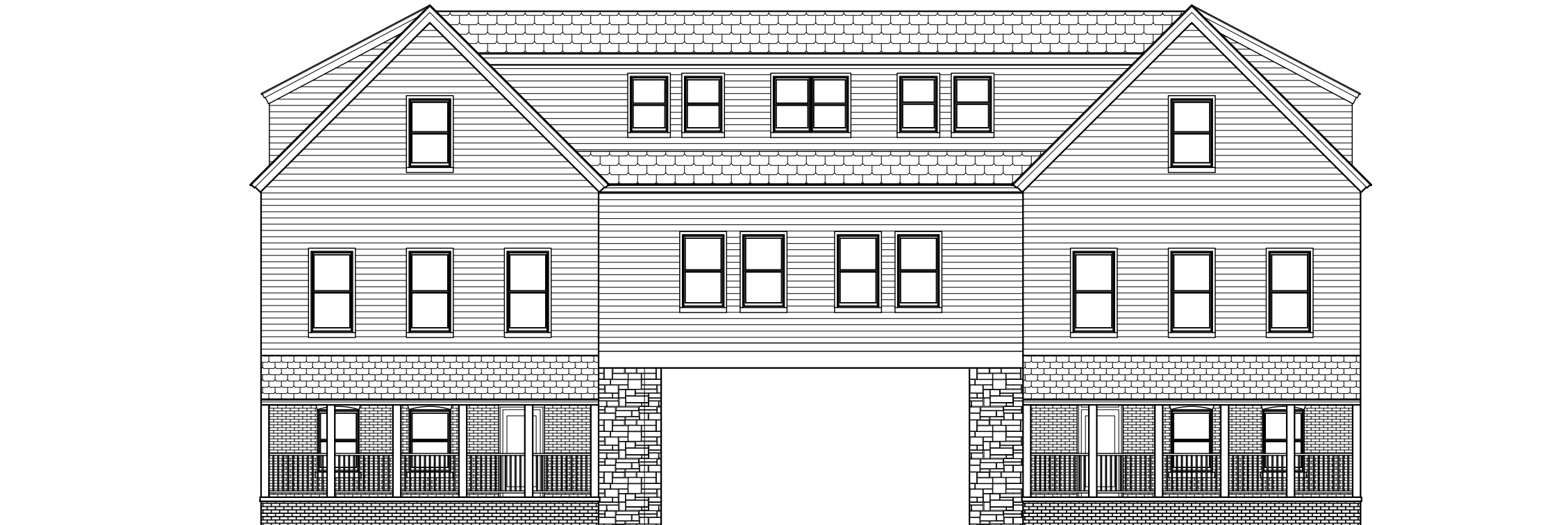
Eliza Street Elevation