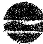
Joe Martens Commissioner

New York State Department of Environmental Conservation Division of Environmental Permits, 4 th Floor 625 Broadway, Albany, NY 12233-1750 Phone: (518) 402-9167 • Fax: (518) 402-9168 Website: www.dec.ny.gov