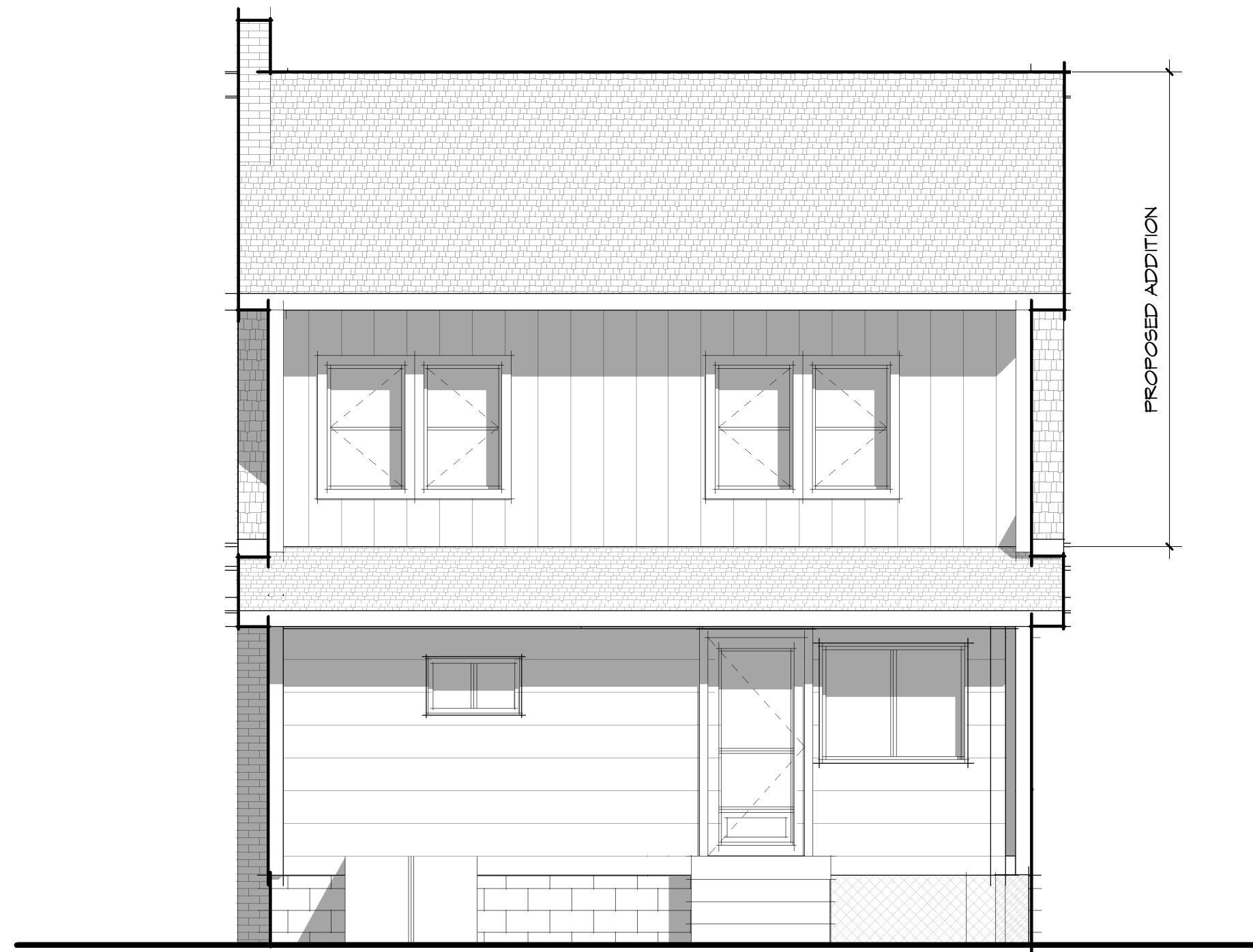
4 A4.1 1/4" = 1'-0" PROPOSED BACK ELEVATION

THESE DRAWINGS ARE INSUFFICIENT FOR CONSTRUCTION WITHOUT THE SEAL AND SIGNATURE OF THE ARCHITECT OF RECORD © COPYRIGHT 2016 WHALEN ARCHITECTURE, PLLC