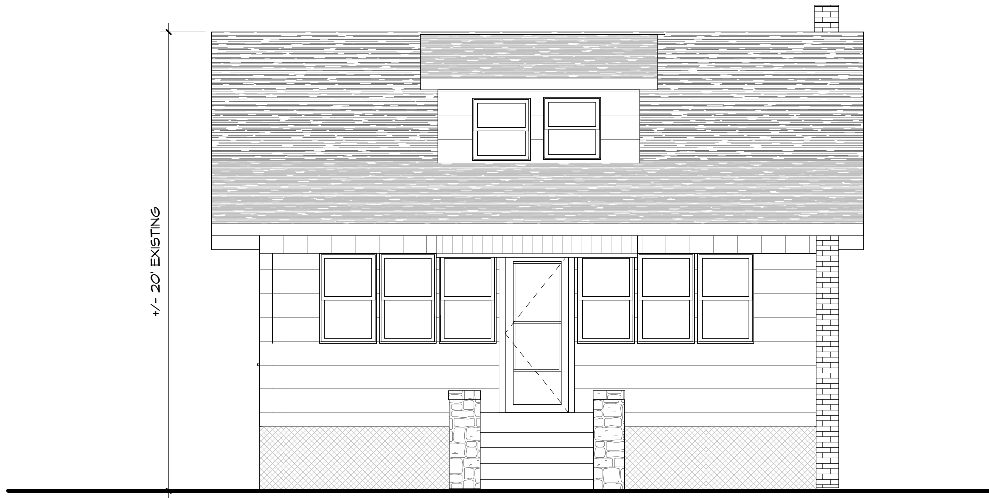
4 EXISTING FRONT ELEVATION A4.0 1/4" = 1'-0"