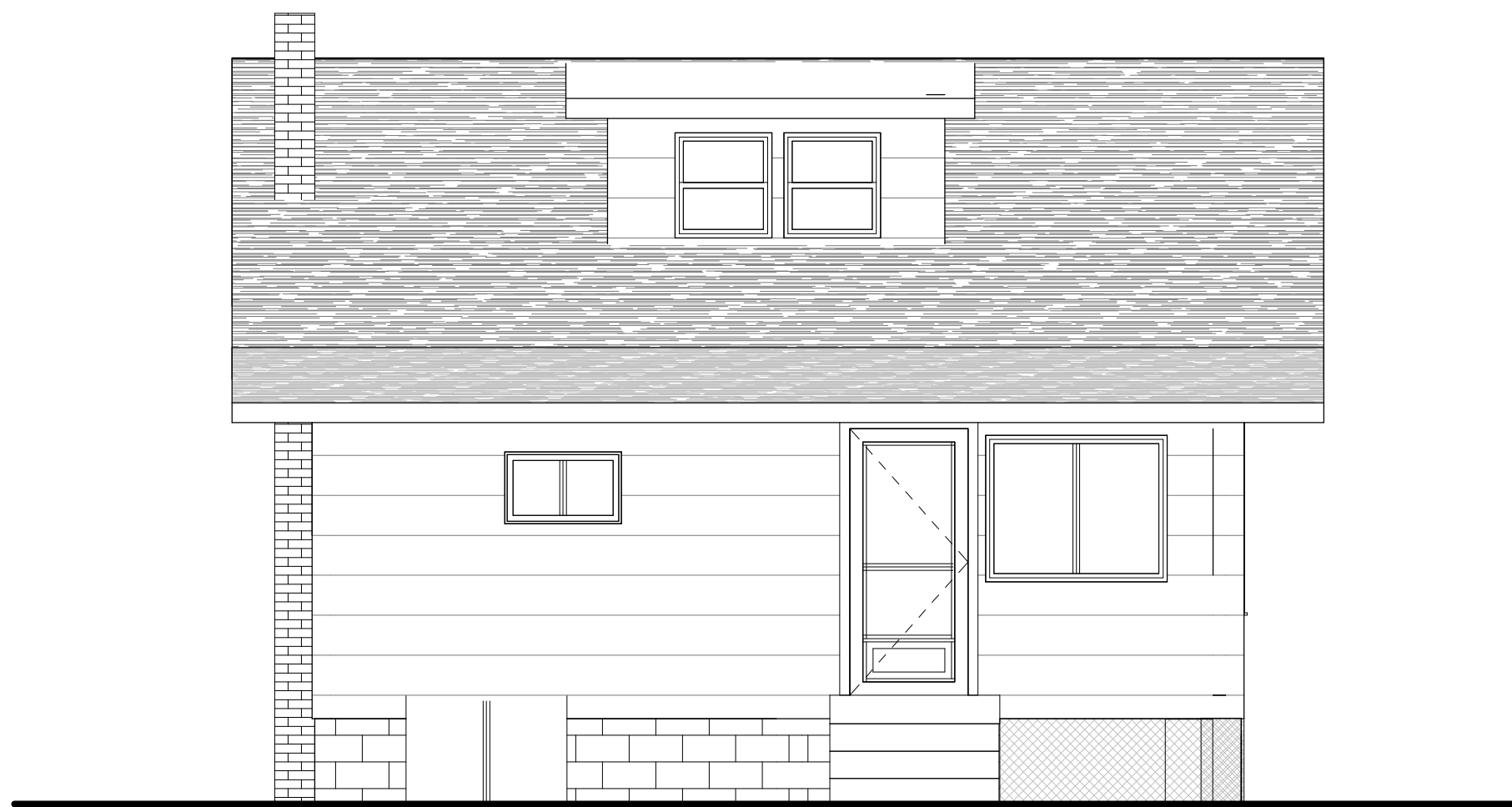
3 EXISTING REAR ELEVATION A4.0 1/4" = 1'-0"

THESE DRAWINGS ARE INSUFFICIENT FOR CONSTRUCTION WITHOUT THE SEAL AND SIGNATURE OF THE ARCHITECT OF RECORD