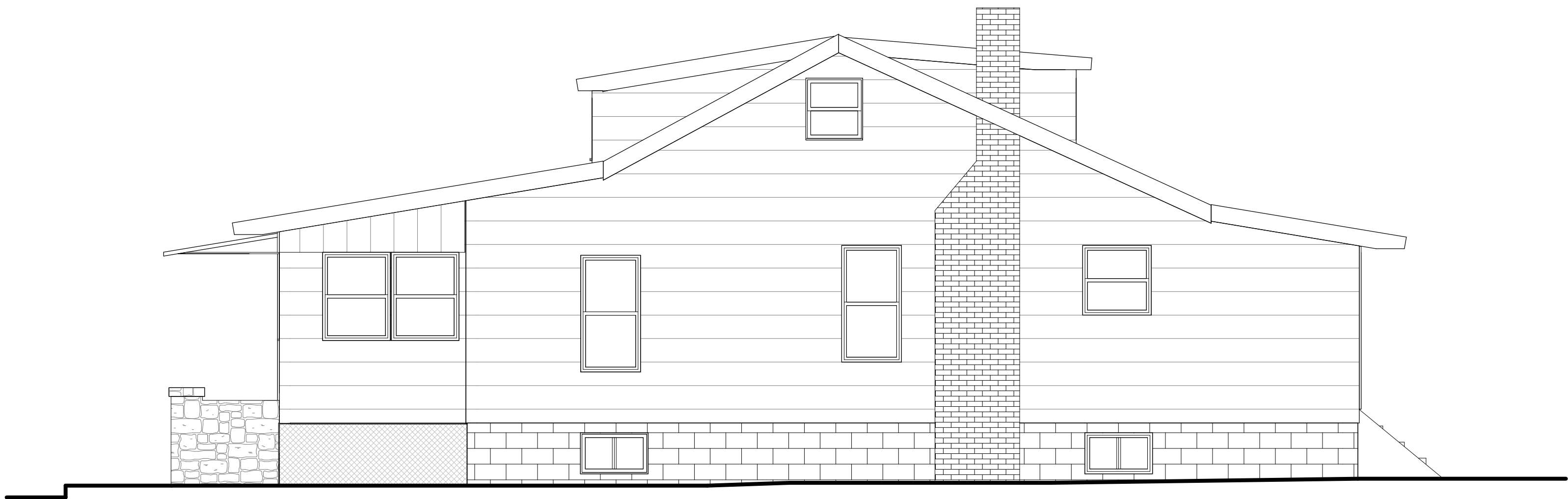
2 EXISTING RIGHT ELEVATION A4.0 1/4" = 1'-0"